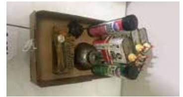
Lot#20779. Lot of misc oilers