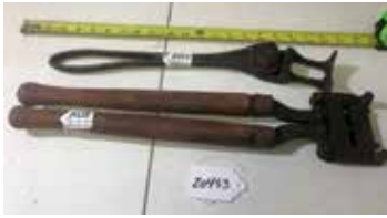
Lot#20453. 2 pieces, fence stretcher and wire fence tightener