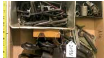
Lot#20331. Lot of misc shop items, incl. champion bench clamps