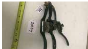
Lot#20534. 3 Stanley Spoke Shaves No 51, 53, 53A