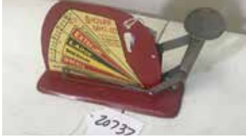
Lot#20737. Brower MFG Co. Egg Scale, Quincy IL