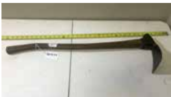
Lot#20477. Mullson & Co. 4 1/4 inch Blade Carpenter's Adze