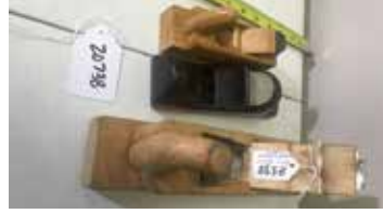
Lot#20738. Lot of 3 Interesting Hand Planes, incl 2 horn planes