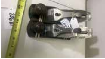
Lot#20681. 2 pieces, Stanley no 4 & 4C Bench Planes