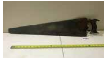
Lot#20351. Rare 28 inch Henry Disston and SON Handsaw, scarce