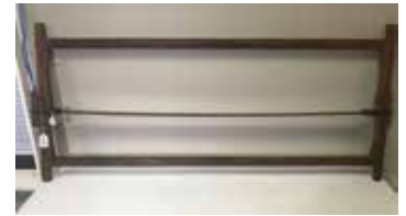
Lot#20468. 64 inch blade Veneer Typr Saw, early and nice