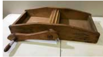
Lot#20651. 12 x 25 1/2 inch wooden butter worker, (The Rice Biskuit Co)