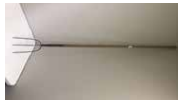
Lot#20251. 3 prong thresher's fork, 6 foot handle