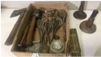
Lot#20800. Box Lot scrapers, meat tenderizers and more