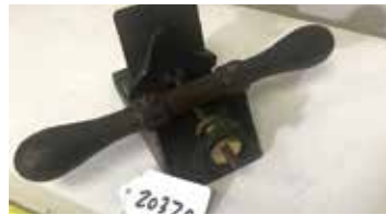
Lot#20370. Stanley No. 12 Scraper Plane