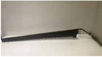
Lot#20229. 54 inch blade ice saw, nice