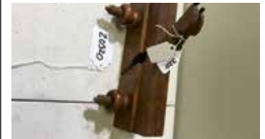
Lot#20520. C J Smith and Co. Cin. 0 1853-58 Sash Plane