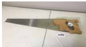
Lot#20366. Unfinished Foley Saw Blade and Handle