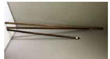
Lot#20732. Stanley (faint stamp) Mo. 480 & Lufkin 7166 Extension stick with damage