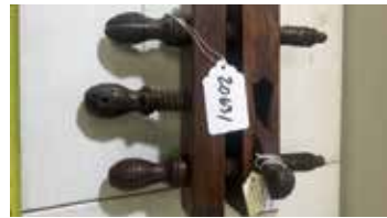
Lot#20631. Early European Fruitwood Plow Plane Three Arm