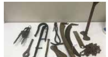
Lot#20284. Bucket of misc farm items incl hitch