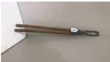
Lot#20445. Uncommon Bull Catcher Device