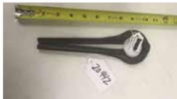
Lot#20442. Uncommon Horsetwitch