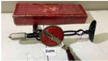
Lot#20549. Millers Falls No. 12 Breast Drill, original box