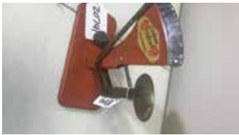
Lot#20741. Cyclone Quality Egg Scale