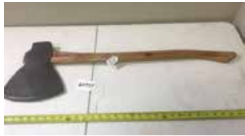
Lot#20777. Hewing Axe, 9 inch early blade, with replaced handle