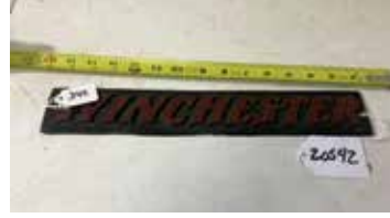
Lot#20542. 14 x 2 1/4 inch cat iron Win- chester Logo