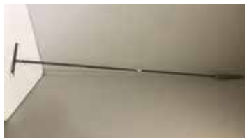
Lot#20450. 86 inch long, grain tester/sampler