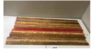
Lot#20428. Lot of 14 yardsticks from North-eastern States