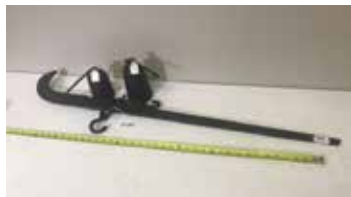
Lot#20214. J Chatillon and Sons 43 inch steelyard scales, 2 weights