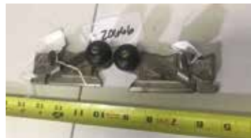
Lot#20666. Pair of Stanley No 98 and 99 Side Rabbet Planes