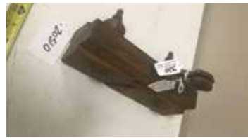
Lot#20510. RW Booth Double Iron Sash Plane, Cin. 0