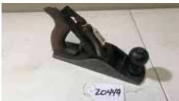
Lot#20449. Winchester No 4 Size plane