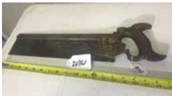
Lot#20361. Early Split Nut R Groves & Son Sheffield Steel Back Saw