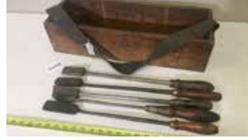
Lot#20459. Lot of 5 horse tooth rasps in wooden case