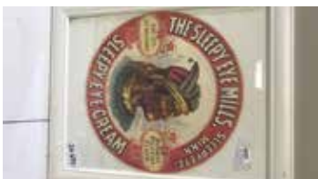
Lot#20693. Framed Sleepy Eye Flour Barrel Copper Print