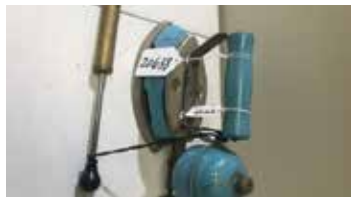
Lot#20638. Blue Coleman Gas Iron with Air Pump