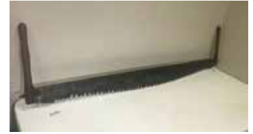
Lot#20464. 66 inch 2 man saw H Disston and Sons Patented May 9, 1871