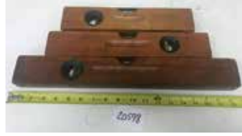
Lot#20598. 3 nice Stanley Cherry No. 104 Levels, 2 have labels, 12, 14, 18 inch