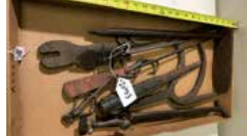
Lot#20403. Tray Lot, early iron inc lifter