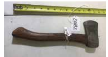
Lot#20692. Embossed Shapleigh Hardware Co. Dog for Sportsman Hatchet