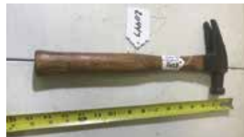
Lot#20447. Winchester Straight Claw Hammer