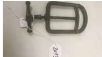
Lot#20439. Horsemen's twitch ring