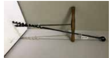
Lot#20272. 2- T handle augers