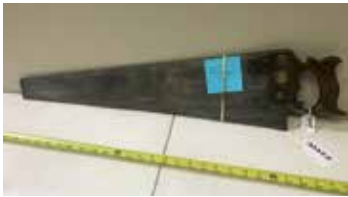
Lot#20605. Woodrough & McParlin Panther Handsaw, good text, rare head