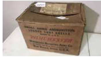
Lot#20707. Cardboard Winchester Shell Box from Shapleigh Hardware St Louis