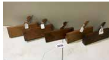
Lot#20526. 5 Cincinnati Moulding Planes, Creagh T.D. & Co. etc.