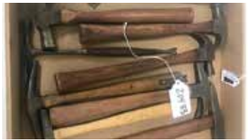
Lot#20433. Lot of 8 good hammers, some very desirable