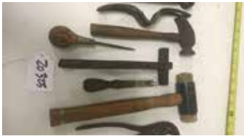
Lot#20325. Box lot of Leather working tools, good lot