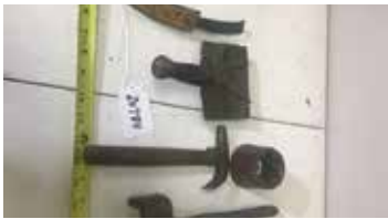
Lot#20784. Box lot Horse related items, and a newer hand corn sheller