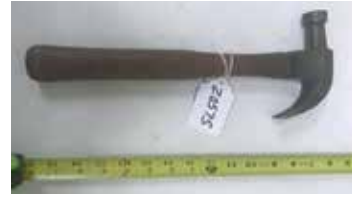
Lot#20575. Keen Kutter 24 oz claw hammer