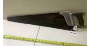
Lot#20604. Henry Disston Aluminum Handle Hand saw