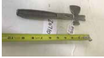
Lot#20710. Clark Bars (candy) Crate Opener, hatchet, etc