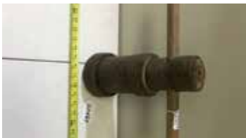
Lot#20469. Primitive Wooden Wagon Jack, 12 inches tall