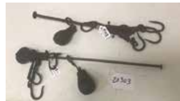
Lot#20303. Lot of 2 pair of small steelyard style scales