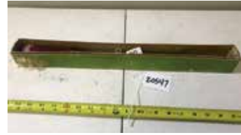
Lot#20547. Yankee No 131A Screwdriver/ Drill in original box