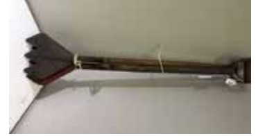
Lot#20264. 2 pieces, 2 similar hay knives Ely's Dandy