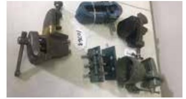
Lot#20763. Lot of 5 Small Bench Vises, different ones included