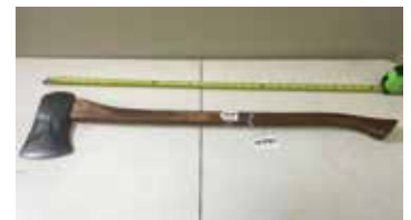
Lot#20480. Nice Belnap Blue Grass Single Bit Axe