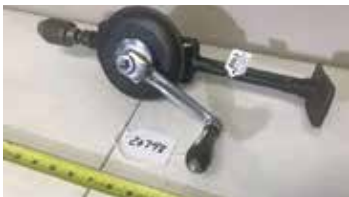
Lot#20748. Yankee No 1555 Ratchet 3 jaw breast drill