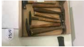
Lot#20762. Lot of 7 Various Small Stanley Hammers and a Hatchet