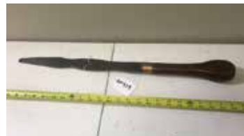
Lot#20419. Early 25 inch HD Turnscrew Marked Improved