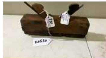
Lot#20530. JL Wayne and Son Hardware dealers Cincinnati Oh Mid 1800's molder