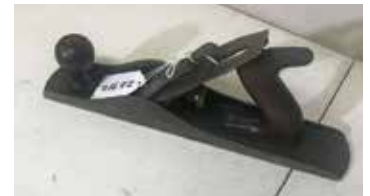
Lot#20352. Winchester W5 Jack Plane