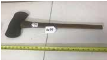
Lot#20341. Embossed Kruse and Bahlmann Axe, damaged handle