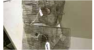
Lot#20268. Lot of 2 wire live traps