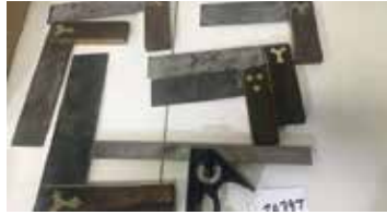
Lot#20797. Lot of 6 tri squares, and a combo square