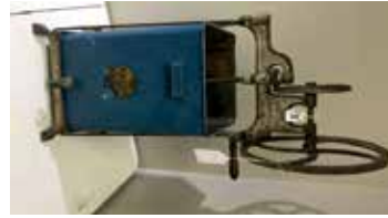
Lot#20603. Dazey 630B Butter Churn Pat. Dec 18, 1917