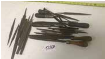
Lot#20329. Lot of 25 plus assorted good files