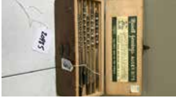
Lot#20485. Like New 13 piece set of Russel-Jennings Stanley Auger Bits