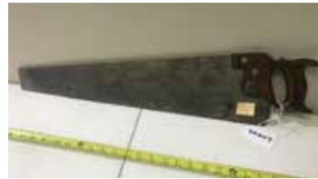
Lot#20607. Early Handsaw 1910-1919 Simons with button