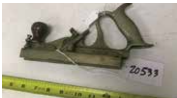
Lot#20533. Stanley No. 49 Tongue and Groove Plane