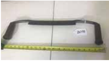
Lot#20733. Heavy 12 inch Cut L & I J White Buffalo NY Draw Knife