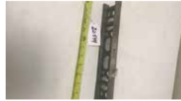
Lot#20539. Millers Falls 12 inch iron plumb and level