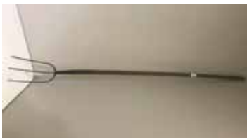
Lot#20249. Union Columbus 3 prong hay fork