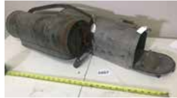
Lot#20267. Lot of 2 early metal mailboxes, incl a rare round one