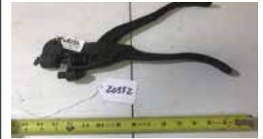
Lot#20332. Heavy Duty 2 man saw, set