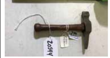
Lot#20544. Early Unusual Hammer Marked W Gilpin (English)