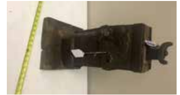
Lot#20400. Early Conestoga Wagon Jack 1889