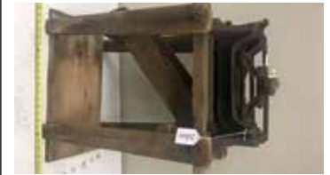
Lot#20300. Aspinwall MFG Co. Potato Cutter Pat March 8, 88