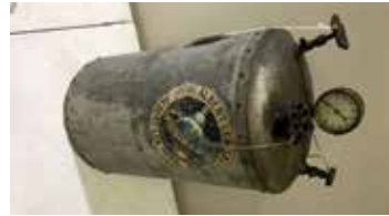
Lot#20259. Albert Lem Co. gas light tank