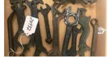
Lot#20432. Lot of 10 assorted Machinery Wrenches