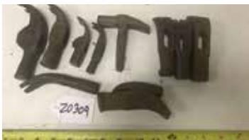
Lot#20309. Tray lot of 11 Hand Forged Hammer heads