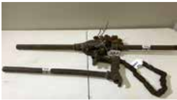
Lot#20209. 2 piece lot, Chain Wrench and a Bolt Threader