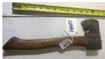
Lot#20694. Embossed Buster Brown Shoes camp axe