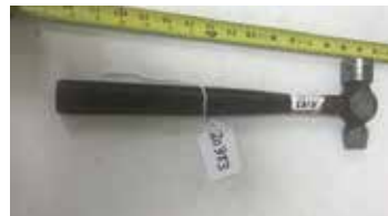
Lot#20383. Chaeney Straight Peen and True Temper 32 oz ball peen hammer