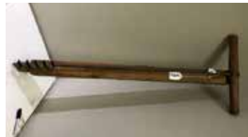
Lot#20490. Wood Auger, mounted on a wooden 48 inch pipe