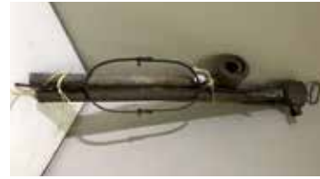
Lot#20287. Farmers lot, Water Cup, Barrel Pump, Kow Keager, etc.