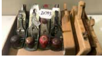
Lot#20793. Box lot of 4 Various Iron Planes and 4 wooden molders