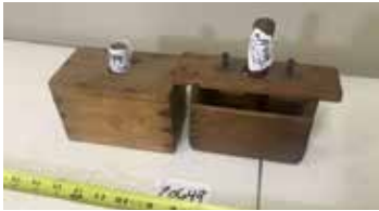
Lot#20649. Lot of 2 wooden butter molds