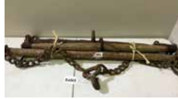
Lot#20263. My Hillbilly VOIG doubletree