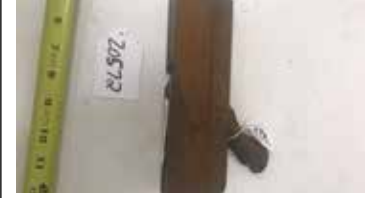
Lot#20572. Early American Chestnut Spill Plane