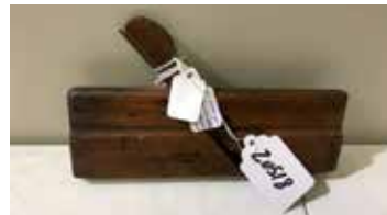
Lot#20518. Early Lindenberger Marked Moulder, early 1800's