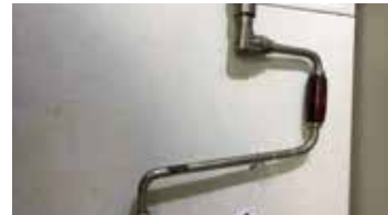
Lot#20495. Nice Millers Falls, Wimple Brace No. 7312A-12 inch