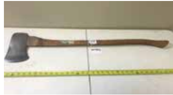
Lot#20482. Good Keen Kutter Single Bit axe