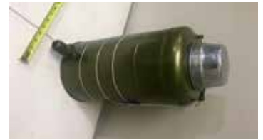
Lot#20636. Unusual Stanley metal picnic Jug