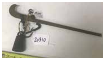
Lot#20310. Cute Small Buffalo Forge Brass Steelyard scale