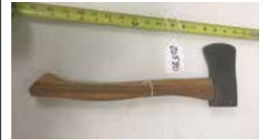
Lot#20580. 20th Century Hand Axe, 16 1/2 inch long