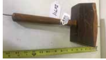
Lot#20711. Stanley No. 13 woodworkers wooden mallet