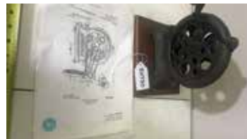
Lot#20750. New Era Mfg Co. Rope Winder, Minneapolis MN Pat. July 18, 1911