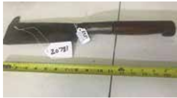
Lot#20781. Primitive Early Blacksmith made wood chopper