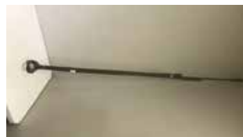
Lot#20219. 3 pieces- 3 iron workers stoker irons, 7 foot and shorter