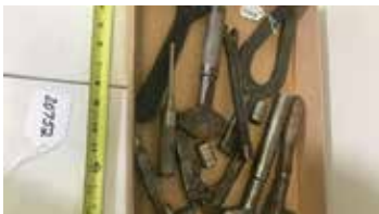
Lot#20752. Lot of 10 assorted uncommon wrenches