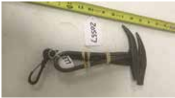
Lot#20577. Lot of 2 Hand Forged Snow Knocking Hammers