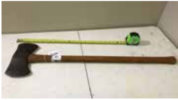
Lot#20201. Wards Master Quality 2 bit axe