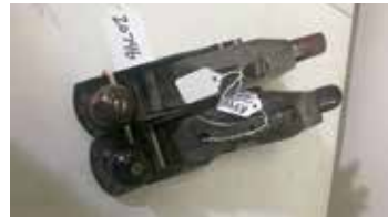
Lot#20746. 2 pieces, 2 Fulton Tool Hand Planes, no 3 and no 4