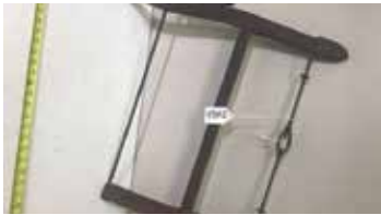
Lot#20465. Nice Buck Saw with unique saw tightener device