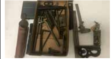
Lot#20324. Box lot of interesting items, what's it