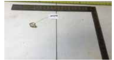
Lot#20608. Lakeside Takedown Square