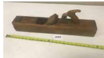
Lot#20559. Exceptionally Nice J Lawter 22 inch Jointer Plane 3 star 1849-52