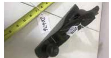
Lot#20676. Stanley No. 5 1/4 Jack Plane Blade Marked PAT. Applied 1992