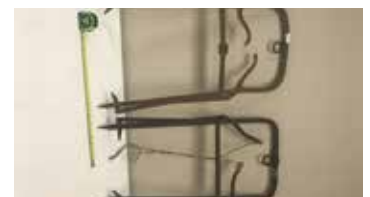
Lot#20228. Lot of 2 hay harpoons