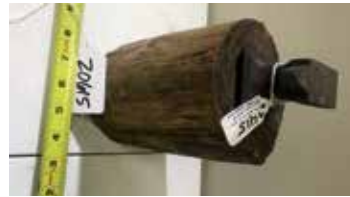
Lot#20615. Small Anvil on Stump Marked Cincinnati Tool Co. PLEASE NOTE SIZE, not full size, rare