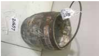
Lot#20657. Wooden 1 gallon Paint Bucket Marked FE Spiers and Co CIN. Early and good