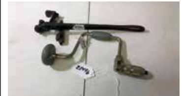
Lot#20496. 2 pieces Stearns Floorlayers Jack, Stanley Handyman Brace, Like new