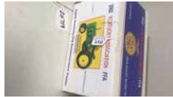
Lot#20719. 2002 Kentucky Association FFA 1/16 Scale John Deere Model 60 Tractor