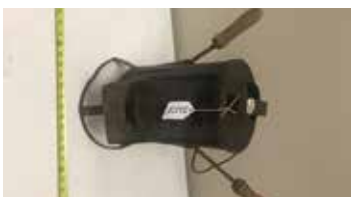
Lot#20225. Lead Solders stove and soldering irons