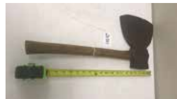
Lot#20311. P Jordan N. Boston 8 1/2 inch Broad Hewing Axe