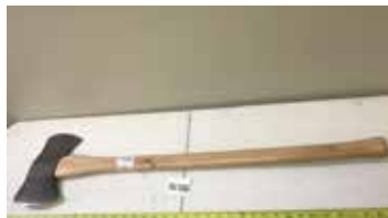
Lot#20726. Blue Juniata Double Bit Axe, H Miller Hardware Co. with replacement handle