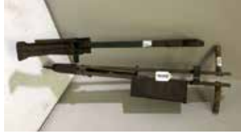
Lot#20206. Lot of 2 hand corn planters