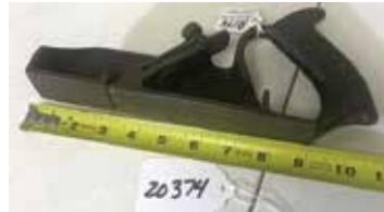
Lot#20374. Stanley No. 190 Rabbet Plane