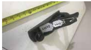
Lot#20354. Winchester No 3005 No 4 Size Plane