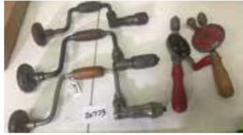
Lot#20773. Lot of 3 hand braces, Stanley No. 925, 045 English, and 2 hand drills