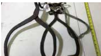
Lot#20393. Lot of 3 all different size ice tongs