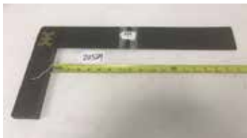
Lot#20529. Uncommon Size Tri-Square 10 x 20 inch