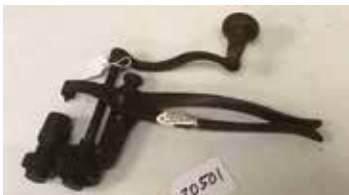
Lot#20501. Stanley No. 1 Buggy Wheel Bolt Nutsetter, Scarce