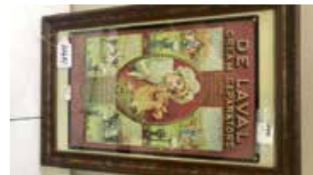
Lot#20691. Framed Metal DeLaval Cream Separator Sign