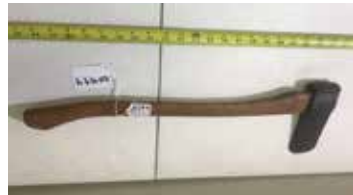
Lot#20494. 2 pieces, Pa. Post Axe and Commander