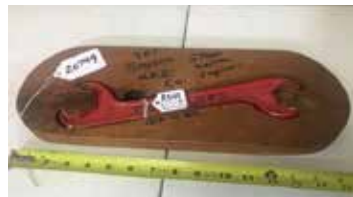
Lot#20749. The Geiser Mfg Co. Peerless Wrench Steam Tractor Engine