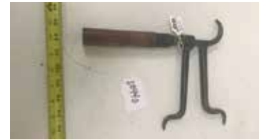
Lot#20440. Early Veterinarian Speculum