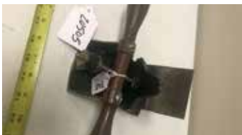
Lot#20505. Stanley no. 12 Scraper Plane- Stanley Blade