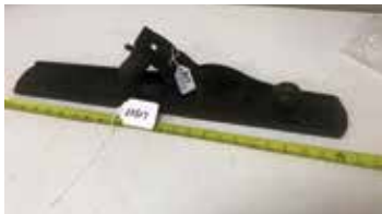
Lot#20517. Stanley No. 8 Jointer Plane,