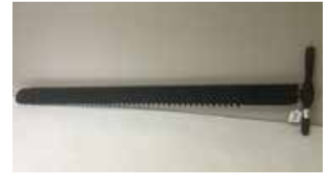
Lot#20232. Early Different 58 inch ice saw blade