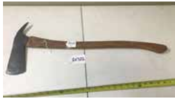
Lot#20722. Nice Ice Axe Marked WT Wood