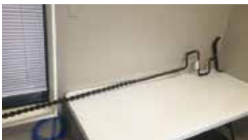
Lot#20253. Coalminer's drills, 2 pieces