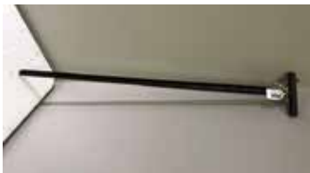
Lot#20669. Long 32 inch Cheese Tester RARE