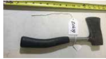
Lot#20679. True Temper Boy Scout Hatchet