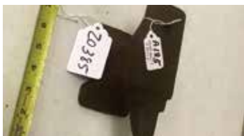
Lot#20385. 7 Pound unmarked anvil