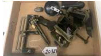
Lot#20327. Lot of ATHA and Stanley items, some quite rare