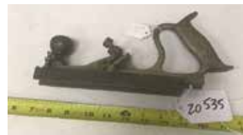
Lot#20535. Early Stanley No. 48 Tongue and Groove Plane Pat. July 6, 1875