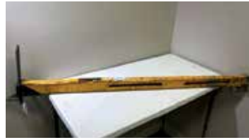
Lot#20454. Stanley Marked Railroad Track Level, adjustable