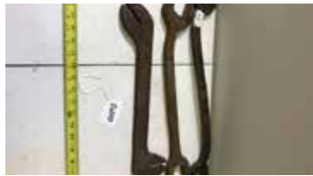
Lot#20210. Lot of 3 Large Iron Wrenches