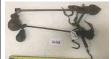
Lot#20308. Lot of 2 Pair Steelyard Scales, 1 marked JS and S