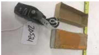
Lot#20521. Stanley No. 100 1/2 Round Bottom Block Plane in Box