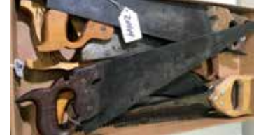
Lot#20404. Tray lot, of 10 various decent smaller saws