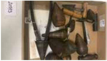
Lot#20593. Stanley Item Lead Pipe Expander PAT. May 5 1890 Reamer and Bobbins