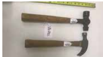
Lot#20382. Stanley Straight Peen and Palmer Forged Claw Hammer