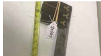
Lot#20527. 3 Nice Stanley No. 20 Tri Squares, Pat 12-19-96