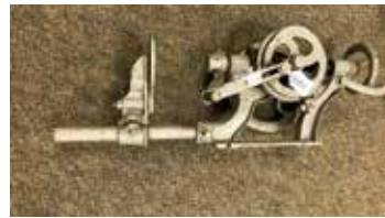
Lot#20211. Silver MFG Co. Salem Ohio Post drill