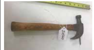
Lot#20560. Cheney Nail Starting Claw Hammer