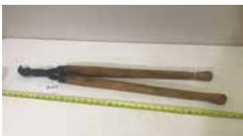
Lot#20217. 2 Orchardmans Loppers