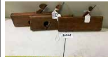
Lot#20528. 3 LR Carter and Donaldson Moulders, Cin. 0