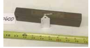
Lot#20600. Stratton Bros. 8 inch brass bound plumb and level