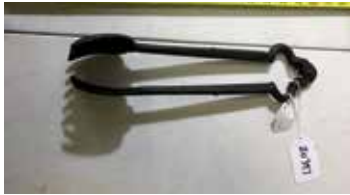
Lot#20397. 2 Pair Tongs, fireplace, and unique ice like tongs