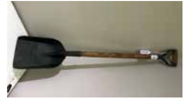
Lot#20204. Koppers Coke- Miami Coal Co. MK Shovel