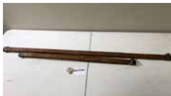
Lot#20730. Unmarked Stanley No 240 and marked No.360 Extension strike