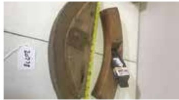
Lot#20778. 2 Coopers Tools DM Harrison Plane, and an old Croze