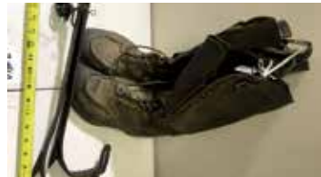
Lot#20410. 2 items, pair of tall logger's leather boots and climbing spikes