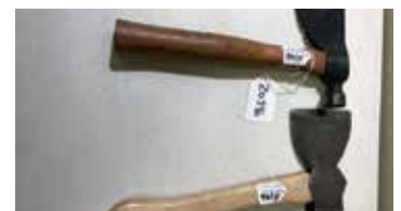
Lot#20396. 2 hatchets, Germantown Works, and Stanley