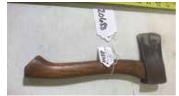
Lot#20688. Cub Scout Size Boy Scout Hatchet