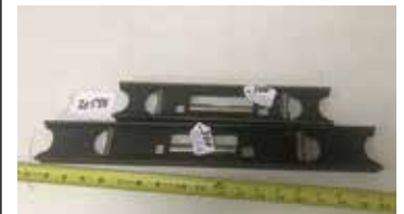
Lot#20588. 2- No. 36 Stanley Plumb and Level, 12 and 18 inch