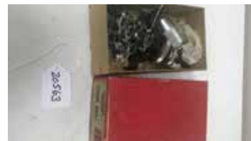
Lot#20563. Millers Falls No. 719 Chain Drill attachment, new in original box