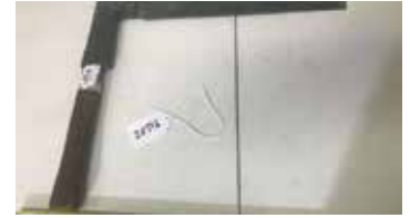
Lot#20716. DSIOI Chisel Axe with replaced handle, uncommon