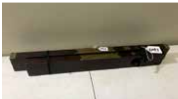
Lot#20413. 2 early levels, DM Lyon 24 inch,, and Hall & Knapp 28 inch, both nice