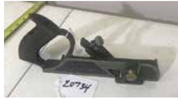
Lot#20734. Stanley No 191 Rabbit Plane Complete