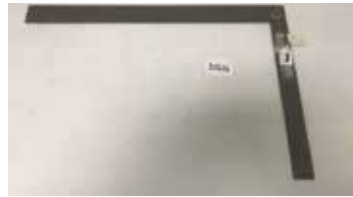
Lot#20606. Twix MFG Co Takedown Square, Rare