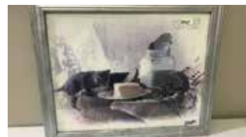
Lot#20695. Cute Cat-Barrel Butter Churn Framed Print