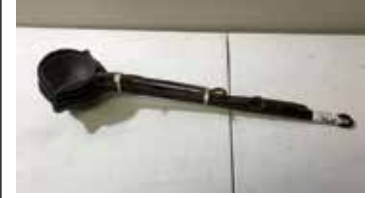
Lot#20292. Lot of 4 lead or rabbit dippers