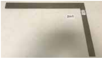
Lot#20613. Stanley No. 500C Steel Square in excellent condition