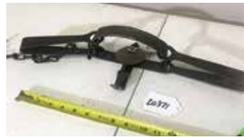
Lot#20371. No 4 Victor Leg Hold Trap