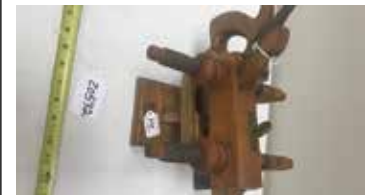
Lot#20532. Ohio Tool Co. HA Lanhurst Boxwood Plow Plane with Stand,