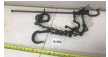
Lot#20344. Rare Butcher's Iron Steelyard Scales, complete