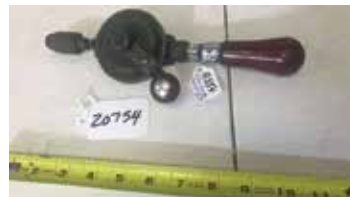
Lot#20754. Millers Falls No 1530 3 jaw hand drill