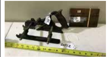
Lot#20552. Millers Patent No. 43 Bull Nose Plow Plane with box, original cutters