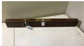
Lot#20414. Stanley No.95 brass bound plumb and level, nice