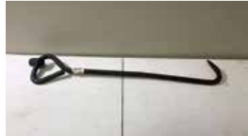
Lot#20294. Uncommon Steel workers wrench, (bridge builders)