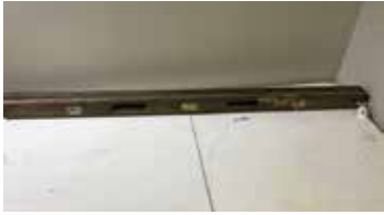
Lot#20293. 2- 48 inch brass bound levels