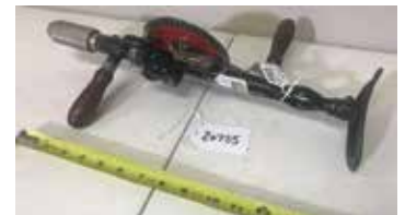
Lot#20755. Millers Falls No 12 2 jaw breast drill, like new