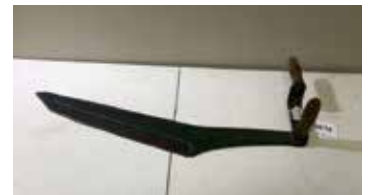
Lot#20276. Patent Sept 5 1899 Hay Knife near new