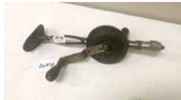
Lot#20378. Stanley No 2, 2 jaw breast drill