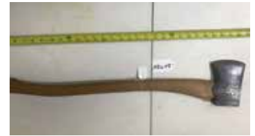
Lot#20724. Embossed WM Penn Axe-Suplee Biddie Hardware Co. Phila. One of the better axes in this catalog