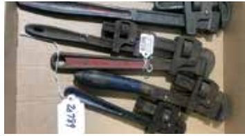
Lot#20789. Lot of 5 various pipe wrenches, 16 inch and smaller