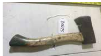
Lot#20675. Collins Official Boy Scout Hatchet