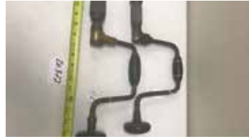
Lot#20322. Lot of 2 Hand Braces, Yankee Bell System, and No 4414 12 inch swing