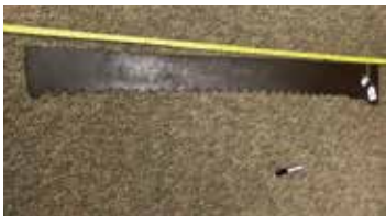
Lot#20245. 60 inch up and down saw blade