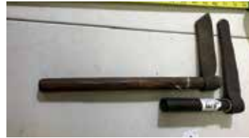
Lot#20399. 2 small Basketmaker Froes