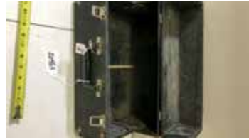
Lot#20463. Vets medicine case