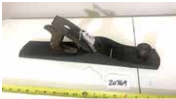
Lot#20369. Ohio Tool Co. #06C Jointer Plane