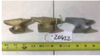
Lot#20622. Lot of 3 Small Anvils, Custom Cast