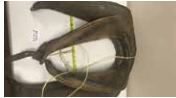
Lot#20286. Lot of 2 leather horse collars