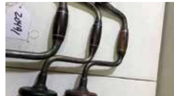
Lot#20491. Lot of 3 early Pre Stanley, Fray and Co. Bridgeport Co. Spofford hand braces