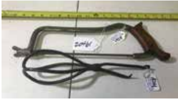
Lot#20461. 2 pieces, 2 interesting tools, dehorning saw, and birthing tool, 72 inches