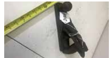
Lot#20364. Millers Falls No 3 Size Bench Plane