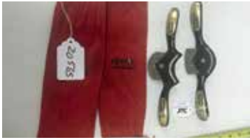
Lot#20565. 2 pieces, 2 Nice AMT Spoke Shaves