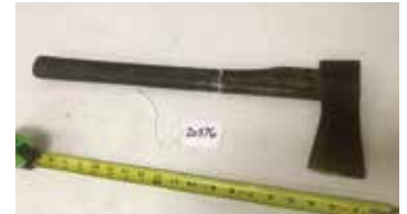
Lot#20376. Early Wagon Makers Axe