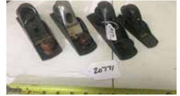
Lot#20771. Lot of 4 Stanley Block Planes, 102, 110, 120, 220