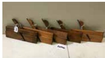
Lot#20506. 5 Pre 1850 Cin. O Moulding Planes Lang-Fugater, Creagh and Williams