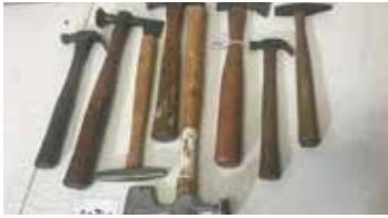
Lot#20760. Lot of 8 Hammers, hatchets, tack shingling