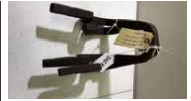
Lot#20288. Rare pair of skid brackets for wagon wheels to load logs