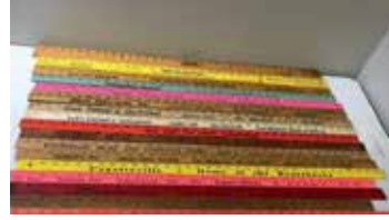
Lot#20431. Lot of 18 Various Good Yardsticks, incl glass and cloth