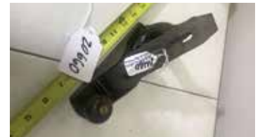
Lot#20660. Stanley No. 2C Bench Plane with V marked blade