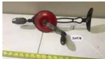
Lot#20474. Millers Falls No. 2100 3 jaw chuck breast drill