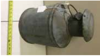
Lot#20705. Early tin 5 gallon milk can