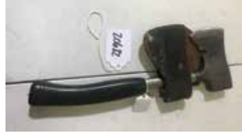
Lot#20682. Stanley Steel Master Camp Axe No SE 1 3/4