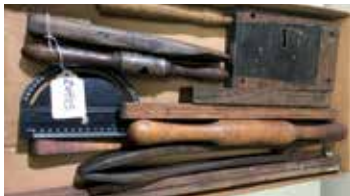
Lot#20405. Tray Lot, Older Wooden Tools, incl. lg door lock