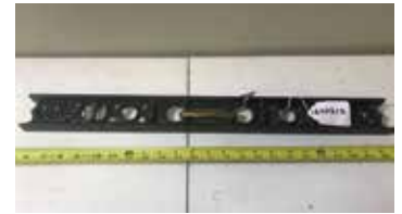
Lot#20612. Davis/Robinson No.9 iron level, no breaks observed