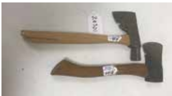
Lot#20301. 2 pieces- Scarce Millers Falls Hatchet, and Wards Master Camp Style Axe