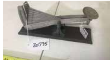
Lot#20735. Acme Egg Grading Scale St Paul MN