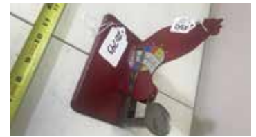
Lot#20743. Modern Hen Shaped Egg Scale