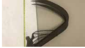
Lot#20290. Myers 4 Hay Hook Grapples, for unloading hay, 4 prong