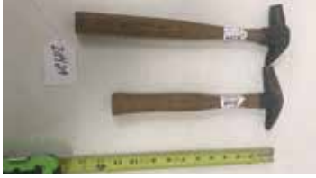
Lot#20429. Lot of 2 good Heller Farriers Hammers