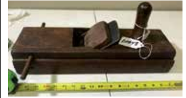
Lot#20548. Massive Crown Moulder with pull Stick, 19 inches long