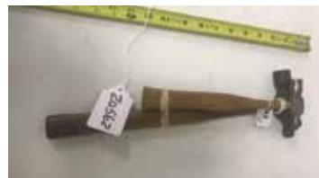
Lot#20562. 2 pieces, 2 unique but similar pair pene hammers