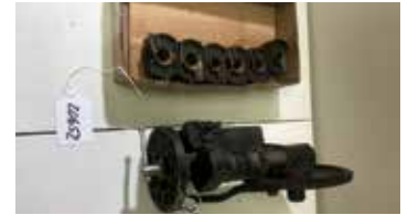
Lot#20652. Stanley No. 77 Rod and Dowel Turning Machine with 8 cutters, uncommon