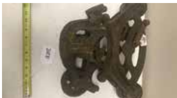
Lot#20281. Ney MFG Co. Canton Oh No 86 Hay trolley