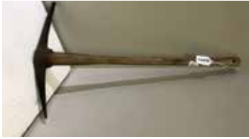
Lot#20237. True Temper No 9 Pick Axe