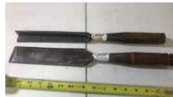
Lot#20335. 2 PS&W Chisels, 1 corner, and 1 framing 2 inch