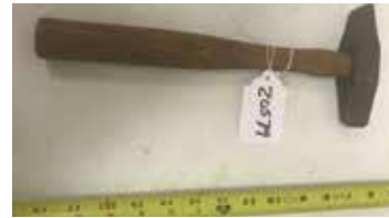
Lot#20579. Berylco Non Sparking Chipping Hammer