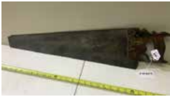
Lot#20609. Early Disston No. 43 Hand saw for restoration