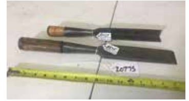
Lot#20775. 2 Chisels, 1 inch corner chisel, and 1 3/4 inch framing chisel