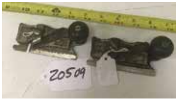
Lot#20509. 2 pieces, Stanley No. 98 and 99 Side Rabbet Planes