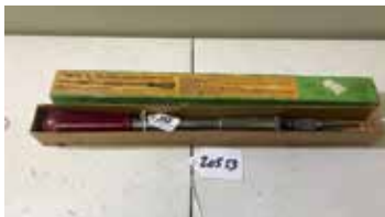
Lot#20553. Yankee No 130A Spiral Ratchet Screwdriver in original box