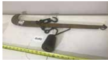
Lot#20342. Brass Steelyard Huddart and Higdon Cin. 0 26 inch with 1 weight