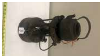
Lot#20226. Gas Lead pot heater