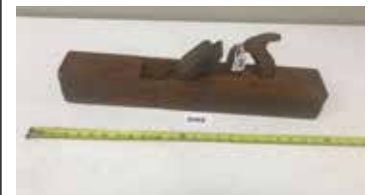
Lot#20508. 22 inch Jointers plane, Marked Shaeffer and Cobb, Cin O, 1853-55