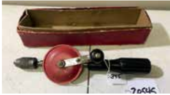
Lot#20545. Miller Falls No. 2500C Hand Drill In original box