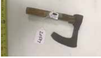
Lot#20597. Early 6 inch blade Bearded Hand Axe, decorated