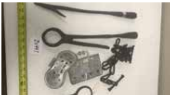
Lot#20441. Box lot, 3 calf weaner, hog catchers, hay hook, cow chain