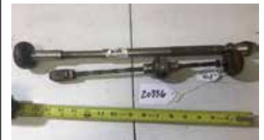
Lot#20336. 2 Early Yankee Screwdrivers No 50 and no. 15