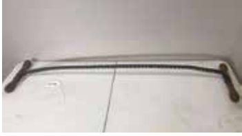
Lot#20709. Uncommon 2 man woodsaw, Backpackers Model