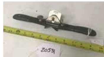
Lot#20531. Stanley Chamfer Spoke Shave no 65