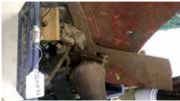
Lot#20241. Farmers lot, Oliver E1 Plow Point and more