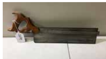
Lot#20391. George Bishop and Co. No. 10 adjustable saw, Cin. O