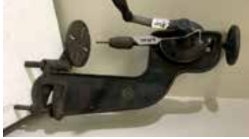
Lot#20401. Millers Falls No. 210 Bench Drill