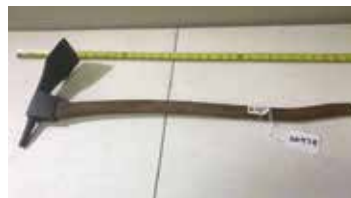
Lot#20478. Nice Polled Carpenters Adze 3 3/4 inch cut