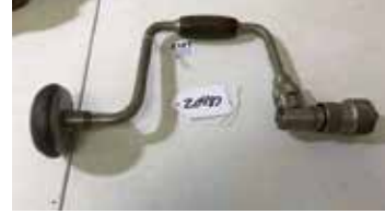
Lot#20487. Good Stanley 813G 12 inch Hand Auger, paint residue