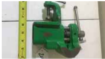
Lot#20630. Dependable Tool 3 inch jaw bench vise, clamp on