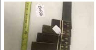
Lot#20536. 4 Tri-Squares 6,9,10,12 inch unmarked