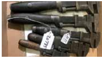
Lot#20785. Box lot of 5 COES Patent Wrenches Different markings w/Patent papers