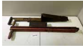
Lot#20243. Lot of 2 hand corn planters