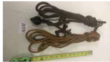
Lot#20435. Lot of 2 Corn Stock Tiers