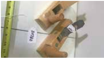
Lot#20780. Lot of 2 9 1/16 inch Wooden Horn Planers, appears new