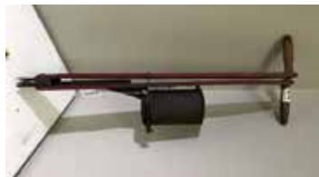
Lot#20274. Hand corn planter, stenciling (faint)