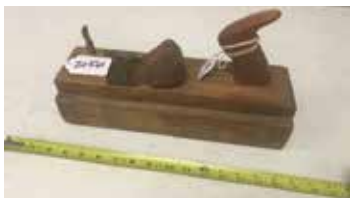
Lot#20561. N Harris & Co. Panel Raiser Cin. O 3 Star Maker 1856-57