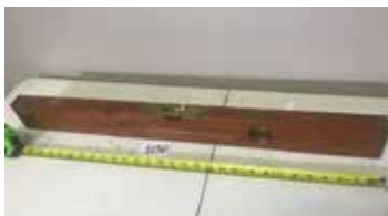
Lot#20365. Early Stanley Rule & Level No 3 Plumb & Level, Nice