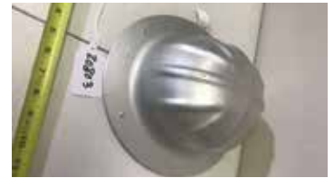
Lot#20803. BF McDonald Oil Field Hard Hat