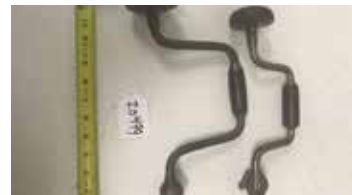
Lot#20499. 2 pieces, 2 Holt MFG Co. Hartford Conn Braces, Pat. May 14, 1880