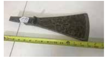
Lot#20783. Primitive Early Style Adze w/ Touch Marks