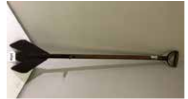
Lot#20260. REVONUE Mowertooth hay knife