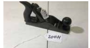
Lot#20444. Winchester No. 3004 Bench Plane no 3 size, nice