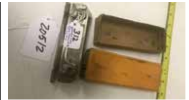
Lot#20512. Stanley No. 79 Side Rabbet Plane in Original Box