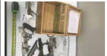
Lot#20500. Stanley no. 55 Universal Combination Plane complete in original box