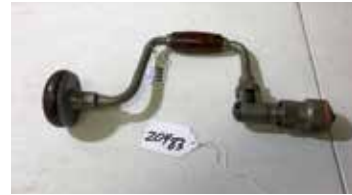
Lot#20483. Like New Stanley No. 813- 10 inch Hand Auger