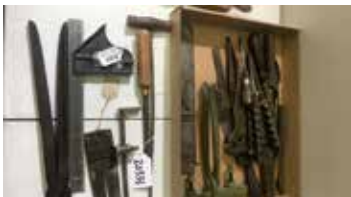
Lot#20333. Box lot of shop items, Bits, tongs, gauges and more