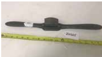
Lot#20525. Stanley No. 56 Coopers Spoke Shave Hard to find