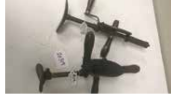
Lot#20319. 2 Breast Drills, Millers Falls, Pat. Jan 21 1890, and another early breast drill