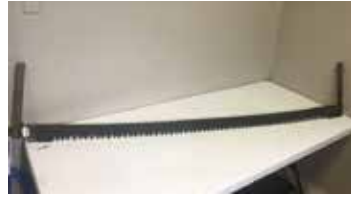
Lot#20462. 6 foot narrow 2 man saw