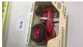
Lot#20731. Ertl 1/16 Scale McCormick WD9 Tractor in original box