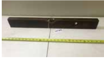
Lot#20769. Stratton Bros Brass Bound 28 inch plumb and level