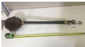
Lot#20222. 2- Smelter Ladles