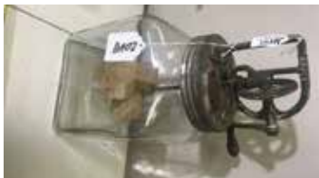
Lot#20641. Dazey 8 quart Patent Dated Butter Churn