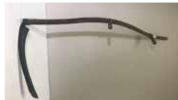
Lot#20247. Good Mowing Scythe