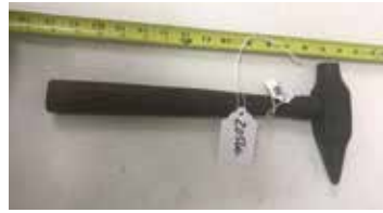
Lot#20566. Coal Hammer Marked Brooks Coal and Ice Co. etc.