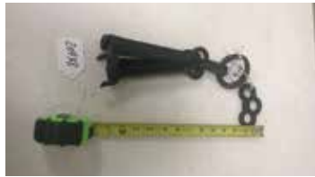
Lot#20438. 2 pieces rare hay rope grab and ring