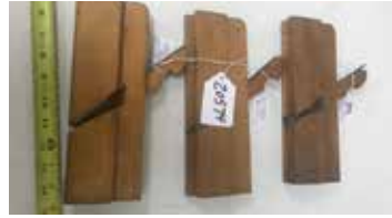
Lot#20574. 3 Moulding Planes 2 Ohio Tool Co. Ind. and one Domic Chicago