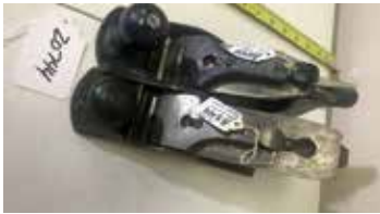
Lot#20744. Keen Kutter No KK4C Hand Plane, plus another plane