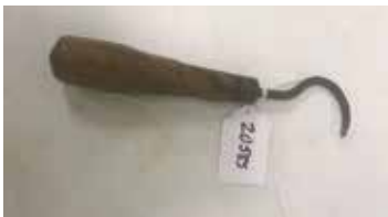
Lot#20585. Fish Hook- Sorter/Mover used in fish cannery