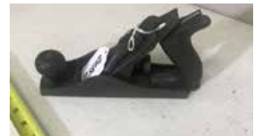
Lot#20356. Winchester No 3004 No 3 size bench plane