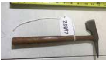
Lot#20697. Rare Non Sparking Pick Hatchet, 11 inches long, head is 5 inches