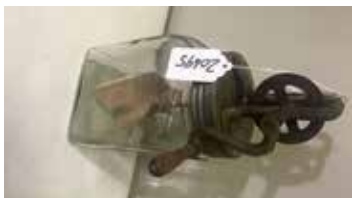
Lot#20645. Dazey 4 Quart Bullseye Butter Churn