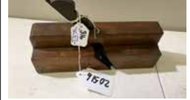
Lot#20516. EF Sexbold Cin. 0. 2 1/2 inch wide Moulder