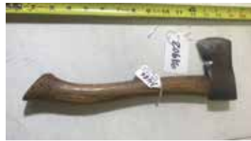
Lot#20686. Rare Trademark GS Girl Scout Hatchet