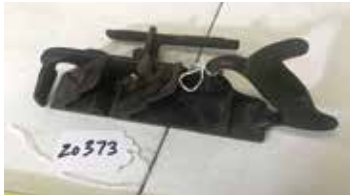
Lot#20373. Keen Kutter No K78 Duplex Plane