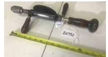
Lot#20751. Yankee 1540 Light Breast Drill, 3 jaw