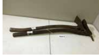
Lot#20207. Lot of 2 Adzes