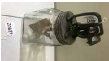
Lot#20637. Dazey 4 quart bulls eye butter churn