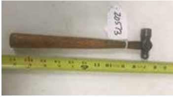
Lot#20573. Nice Stnaly 4 oz ball peen hammer