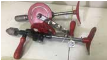
Lot#20776. 2 Breast Drills, Millers Falls, No 13 2 Jaw, and 3 Jaw red drill