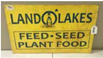
Lot#20685. Land O Lakes Feed-Seed Plant Food Metal Sign