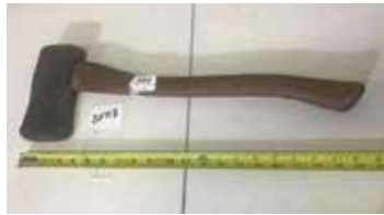
Lot#20718. Embossed True Vermonter Goods that ware, Hand Axe