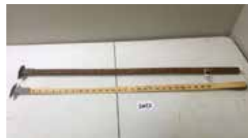
Lot#20423. 2 uncommon Hickory Rule, left hand lumber rule & newer inch only rule