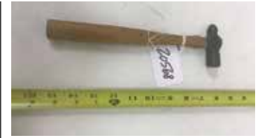
Lot#20568. 4 OZ. Keen Kutter Ball Peen Hammer