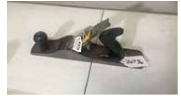
Lot#20736. Stanley No. 5 Two Tone Jack Plane, seen little use