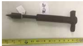
Lot#20586. American Version of the French Cellerman's Hammer