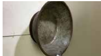
Lot#20659. 17 3/4 inch Older Tin Dough Bowl