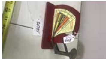
Lot#20745. Jiffey-Way Egg Scale