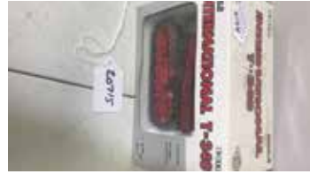
Lot#20715. Ertl 1/16 Scale International T340 Crawler, in original box