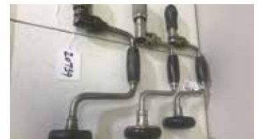
Lot#20759. Lot of 3 good Stanley Hand Augers/Braces, Nos 945-10, 928-8, 924-6