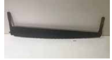
Lot#20460. 48 inch blade 2 man saw, different