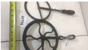
Lot#20756. Lot of 2 travelers, one is primitive