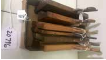
Lot#20796. Lot of 6 Mid 1800's Cincinnati Made Moulding Planers