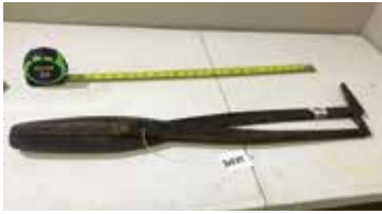
Lot#20285. Iron 31 inch metal shears