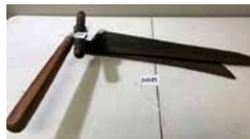
Lot#20283. Lot of 2 blade type hay knives