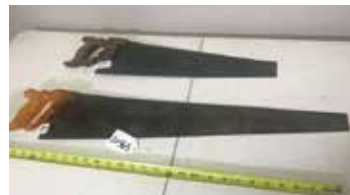
Lot#20363. 2 hand saws, Henry Disston and Son 18 inch blade, split nut and another hand saw