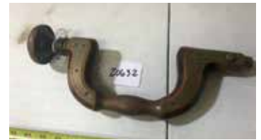
Lot#20632. F Walter and co. Sheffield Brass Appointed Brace