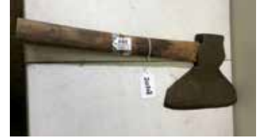
Lot#20208. Simmons and Co. Cohoes NY 11 1/2 inch broad axe