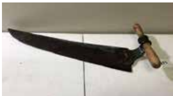
Lot#20273. Blade type hay knives