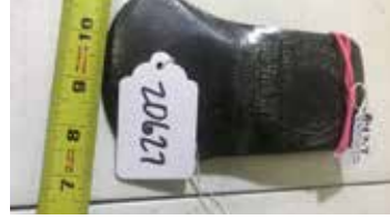
Lot#20627. Rare Abe Lincoln Axe Head, a bit rough but it is one