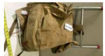
Lot#20704. Experienced Boy Scout Backpack, (incomplete)