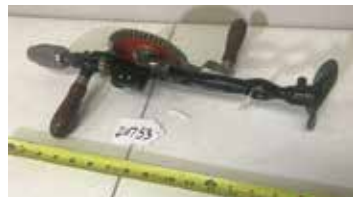
Lot#20753. Miller Falls No 118 3 jaw breast drill, like new