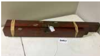
Lot#20417. 3 Stanley Plumb and Level, No, 0-9-13 all have labels