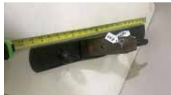
Lot#20362. Winchester 22 inch No 7 size Jointer Plane