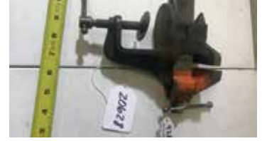
Lot#20628. Stanley #745 2 1/2 inch clamp on bench vise