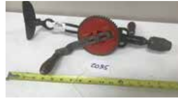
Lot#20315. Hardly Used Craftsman 3 jaw breast drill