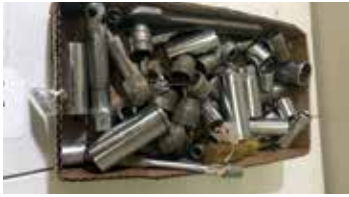
Lot#20788. Large lot of various Sockets