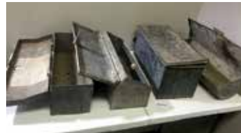
Lot#20271. Collection of 4 early metal mailboxes