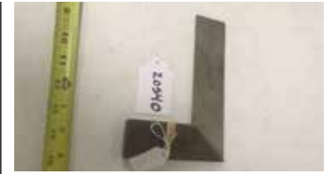
Lot#20540. Winchester Tri and Miter Square