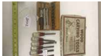
Lot#20502. 6 Piece Buck Bros Carving Set, Millbury Mass.