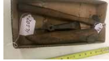
Lot#20571. Rare 3 piece Scythe Sharpening Set Hammer Dingle Stock and holder