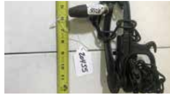
Lot#20455. Fence Stretcher, patented July 30, 80