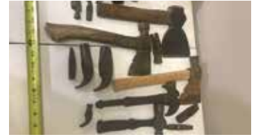
Lot#20799. Box Lot of Misc Tools, old hammers and hatchets