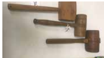
Lot#20302. Lot of 3 Nice Wooden Mallets