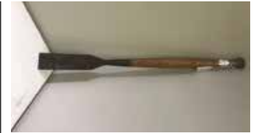
Lot#20484. 39 inch long unmarked 3 1/4 inch stick