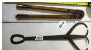
Lot#20395. 19 inch tall double caliper and a wooden divider