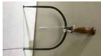
Lot#20667. Uncommon No. 11 Cheese Slicer