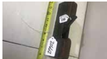
Lot#20662. Uncommon Stanley no. 80 steel cases Rabbet Plane