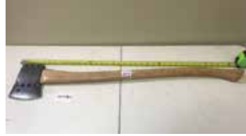
Lot#20486. Unusual Chopping Axe, Holes throughout