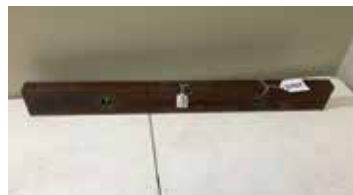
Lot#20422. Stanley No. 30- 30 inch adjustable Cherry Plumb and Level