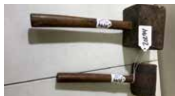
Lot#20394. Lot of 2 wooden mallets