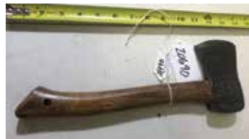
Lot#20690. Embossed Duck in Flight Hatchet Shapleigh Hardware DE