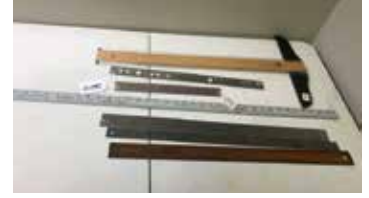
Lot#20795. 7 various rulers, there are some good ones here