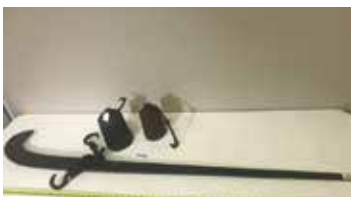
Lot#20221. 64 1/2 inch Steelyard Scales with 2 weights