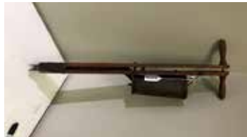
Lot#20270. Nice corn hand planter