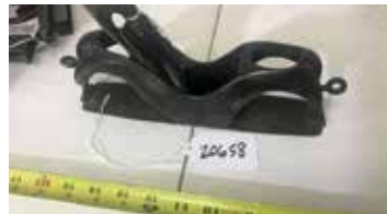
Lot#20658. Early Stanley L Bailey's Patent No 13 circular plane