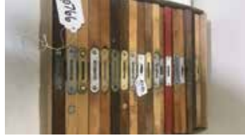
Lot#20766. Lot of 18 small and nice 12 inch levels