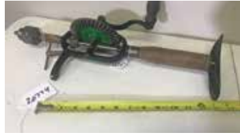
Lot#20774. Uncommon American Madine Co, No 2 Ellison Breast Drill