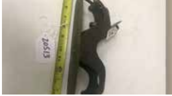
Lot#20513. Early Stanley No. 13 Circular Plane, Breaker Marked Dec 24, 1867