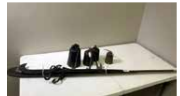
Lot#20216. 2 pieces, 30 inch Marked Cin. 51 1/2 inch steelyard scales with 4 weights