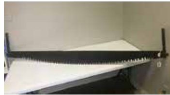
Lot#20466. 80 inch wide body 2 man saw, fairly clean