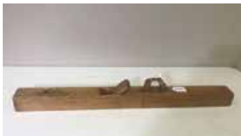
Lot#20557. 42 1/2 inch long Exotic Wood Jointer Plane