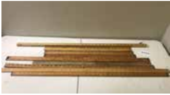
Lot#20425. Lot of 8 Wooden Rulers, Lufkin and more