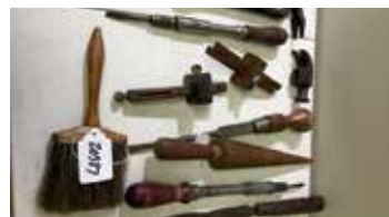
Lot#20387. Box of Misc Shop Tools Screw-drivers, Drills, etc