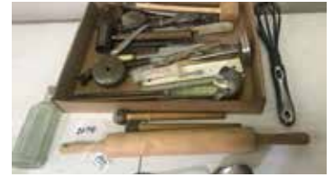
Lot#20791. Box lot misc kitchen items, many pieces