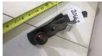
Lot#20663. Nice Fulton No 2 size smooth plane lightly used, if at all