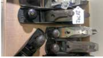
Lot#20792. Box lot of 6 decent Stanley planes