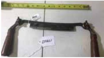
Lot#20621. And. Wilkinson and Co. Boston #8 Folding Handle Draw Knife