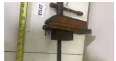
Lot#20368. Neat wooden Work Bench Clamp in the small size