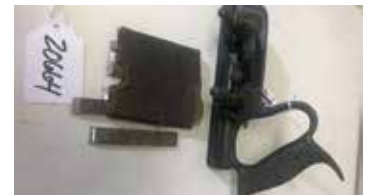
Lot#20664. Rare Stanley No. 54 Plow and Rabbet Plane, needs a depth stop