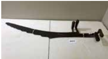
Lot#20269. Lot of 2 slightly different hay knives