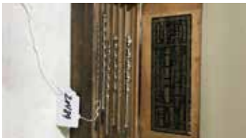
Lot#20489. Older 9 piece set of Irwin Auger Bits in original case