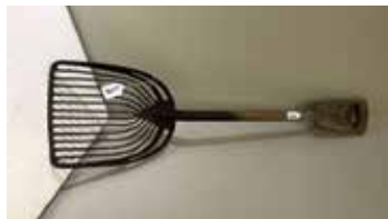
Lot#20246. Rare Cast Iron Potato Shovel