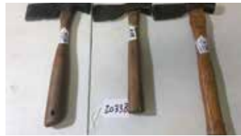
Lot#20338. Lot of 3 Plumb Shingle Hatchets, all different