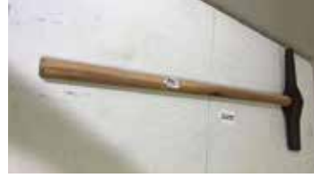
Lot#20235. No. 10 Railroad Spike Driver Maul