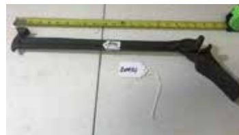
Lot#20451. All iron fence stretcher with hammer handle