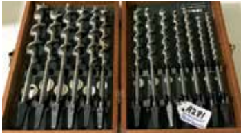
Lot#20481. Like New Set of Irwin Auger Bits All original in box, 13 bits