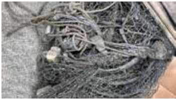
Lot#20297. Appro 50 foot river net with floats