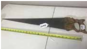
Lot#20349. Used Disston and Marsh Hand Saw for restoration