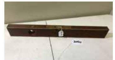
Lot#20420. Stratton Bros. 20 inch brass bound plumb and level