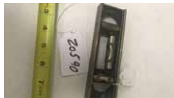
Lot#20590. 6 inch Stanley No. 36 Iron Plumb and Level