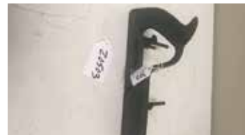
Lot#20503. Stanley No. 248 Weatherstrip Plow Plane