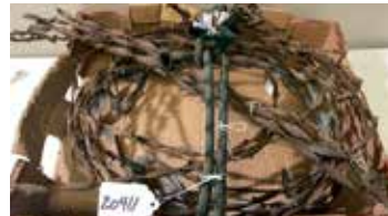
Lot#20411. Lot of several different kinds of early barbed wire