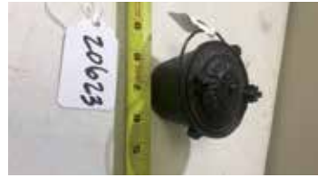
Lot#20623. Beeswax Glue Pot, (Office Desk back in the day) cast iron