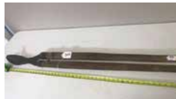
Lot#20215. Tobacco Stalk Deadner Tongs