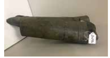
Lot#20236. Maysville KY Single Tobacco Setter