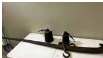
Lot#20218. 69 1/2 inch Steelyard scales with 2 weights