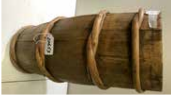
Lot#20653. 22 inch tall wooden storage barrel