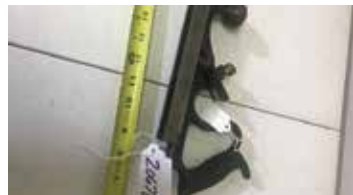
Lot#20670. Stanley No. 48 Tongue and Groove Plane, pat. July 6 1875