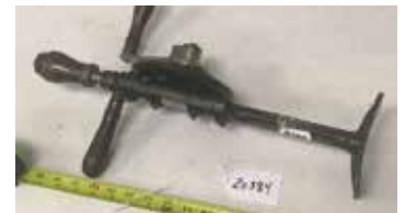
Lot#20384. Yankee No 555 2 jaw breast drill