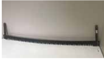
Lot#20238. 66 inch 2 man saw