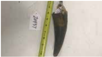
Lot#20437. Dingle Stock and horn holder for scythe upkeep