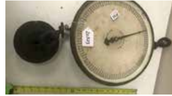
Lot#20323. John Chattillons 200 Dial Scale, 15 inches round