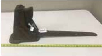
Lot#20265. 12 1/2 inch tall buggy jack