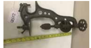
Lot#20380. Keen Bench mount Breast Drill