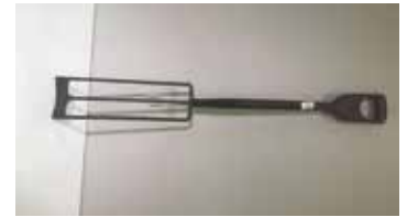
Lot#20244. Older Peat Spade, scarce