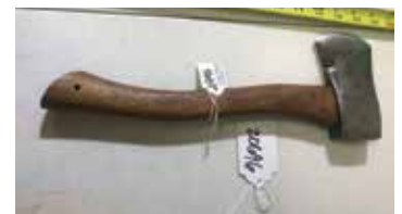
Lot#20696. Embossed Barney and Berry™ USA Camp Axe, Uncommon Mark