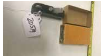
Lot#20519. No. 75 Stanley Bull nose Rabbet Plane Original Box like new