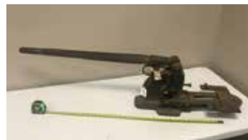
Lot#20255. Machine Co. of Michigan Big Rapids MI. Saw Tooth Cutter