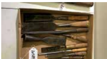
Lot#20389. Box lot 11 various chisels incl. 1 inch corner chisel