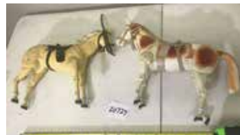
Lot#20727. Lot of 2 vintage articulated paint horses