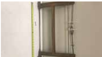
Lot#20497. Lot of 2 framed turning saws