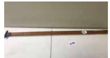
Lot#20416. Lufkin Brass Tip Lumber Graders rule