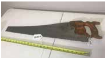
Lot#20357. Heavy Disston and Sons D-17 Hand saw, notice the teeth