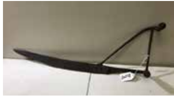
Lot#20258. Hay Knife blade, Pat. July 20, 1876