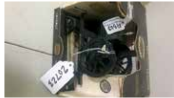
Lot#20723. McCormick Deering Model M 1/6 Scale Hit Miss Engine in original box