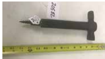
Lot#20582. French Cellarmans Hammer, Near Perfect and scarce