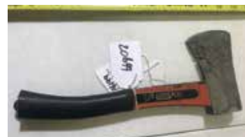
Lot#20699. Vaughn Boy Scout Axe, damaged but hard to find