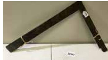
Lot#20407. 3 steel squares in cherry incl. King Cutter tapered sq.