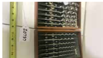
Lot#20757. Set of 13 like new Irwin Auger Bits in original box