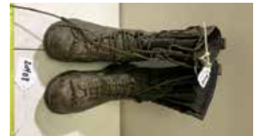
Lot#20408. Pair of original spiked loggers high top boots