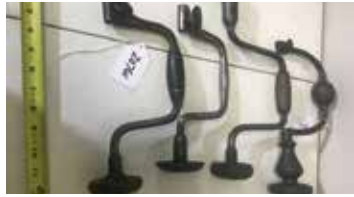
Lot#20761. Lot of 4 early Hand Braces, Sheffield type