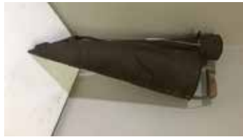
Lot#20242. Owen's Automatic Transplanter, uncommon