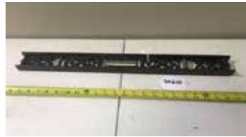
Lot#20610. Jennings 24 inch iron figural level, no breaks observed