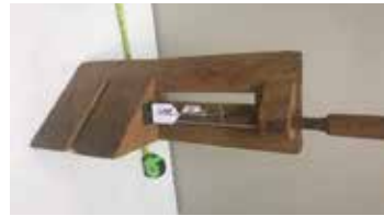
Lot#20611. Approx 29 inch wooden miter jack for workbench