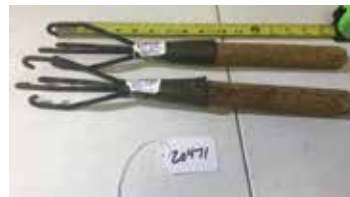
Lot#20471. 2 pieces, early primitive set of rope winders