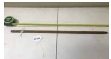
Lot#20700. Rare (The Cottage Creamery) Milk Can, Rule, Cleve. O