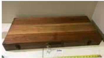
Lot#20801. 34 x 15 x 3 3/4 inch saw tote box, nice