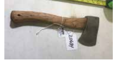
Lot#20684. Left Handed Plumb Boy Scout Hatchet, uncommon