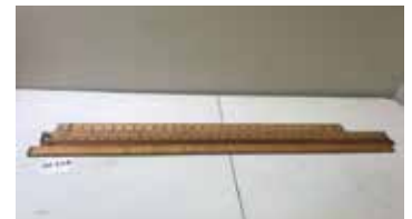
Lot#20728. Lot of 4 Stanley Wooden Measurers Nos. 33, 41, 100, 2141