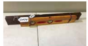
Lot#20424. 2 Stanley Levels No. 23, 24 inch circa 1910 and No.347, 18 inch, both as new