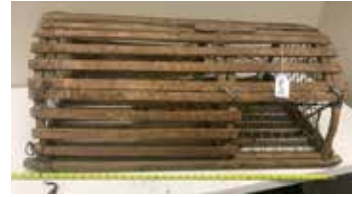
Lot#20295. Early wooden lobster trap from bar harbor