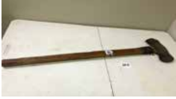
Lot#20205. Early Embossed Double bit Keen Kutter Axe