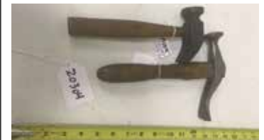
Lot#20304. 2 pieces, cobblers hammer, 1 marked Germany, one marked USMC