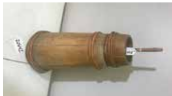
Lot#20642. 3 pieces wooden stomper butter churn