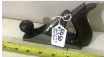
Lot#20650. Stanley No. one (1) Sweetheart Era Smooth Plane, good