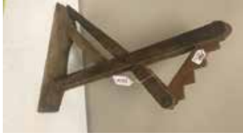
Lot#20261. Nice wooden buggy jack, 27 inches tall