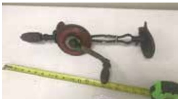
Lot#20381. Millers Falls Breast Drill, Pat. June 10, 1913