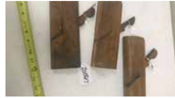
Lot#20567. 3 Warren O. Moulding Planes