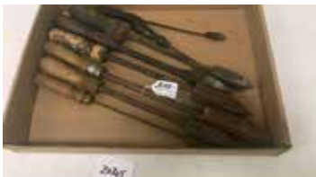
Lot#20305. Lot of 8 soldering irons, incl. brass