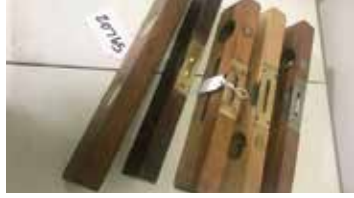
Lot#20765. Lot of 5 12 inch levels, various materials