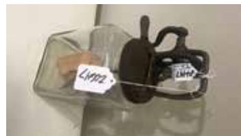
Lot#20647. 4 quart unmarked butter churn