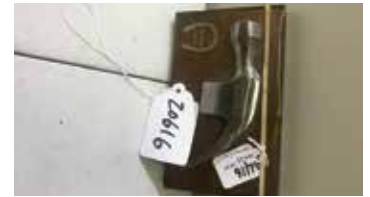
Lot#20616. 1/2 Hammer on Plaque 100 Years Stanley Commemorative 1875 to 1975