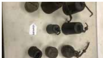
Lot#20254. Styland Scale Weights