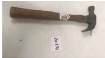
Lot#20330. Cheney Nail Holding uncommon hammer, hexagon poll