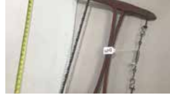
Lot#20291. Nice red painted buck saw