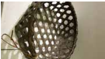
Lot#20661. Rare Early Splint Cheese Makers Basket and curd cutter