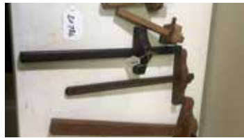
Lot#20786. Box lot of 5 wooden gauges