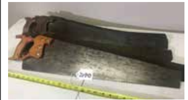
Lot#20340. Lot of 6 older handsaws