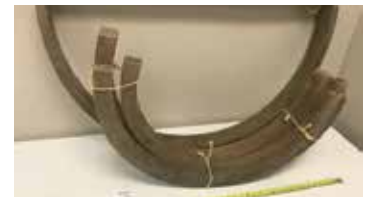
Lot#20252. Lot of 7 Wooden Wagon Fellows