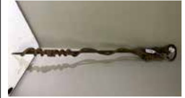
Lot#20296. 48 inch Straw Puller/ Spear with rope