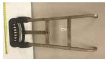
Lot#20227. Feedmill Sack Cart