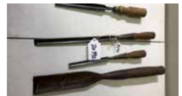
Lot#20392. Lot of 4 Various size gouges incl. a 2 inch