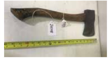
Lot#20708. Stanley Four Square Hand Axe