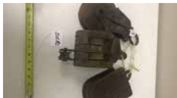
Lot#20282. 3- Hay Rope Pulleys