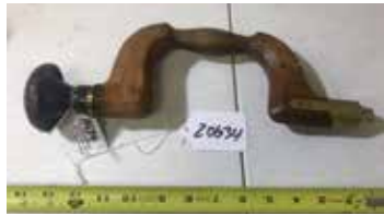
Lot#20634. Nice English Wood Brace Marked M Turner with button, w/ivory ring