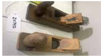
Lot#20742. 3 Spoke Shaves, 2 are Stanley