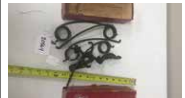
Lot#20564. Rare Buggy Shaft Lifter Device in original box with instructions