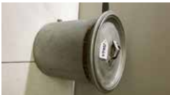
Lot#20665. Maytag Washing Machine Butter Churn, uncommon