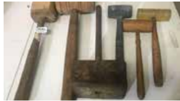
Lot#20782. Lot of 6 assorted mallets, light to heavy