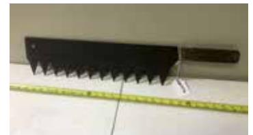
Lot#20472. Early 20 inch, blade ice saw