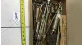
Lot#20457. Large Lot Veterinarians Tools, pattern for clean out