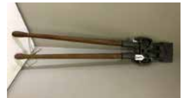
Lot#20448. Nice MX #1202 49 inch dehorner Hammer