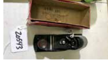
Lot#20543. Millers Falls No. 75 Block Plane in Original Box