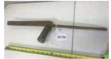
Lot#20720. Early Unmarked European 25 1/2 inch Trybill Square, Scarce