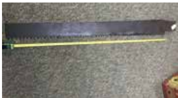
Lot#20277. Early 66 inch up and down water powered saw blade