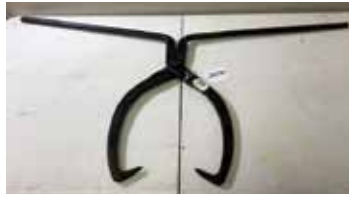
Lot#20230. 2 man railroad tie carrier