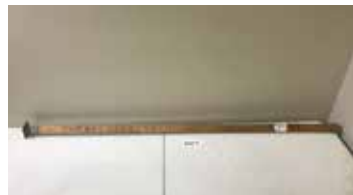
Lot#20418. Lufkin Doyle Scale Log Rule