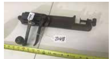
Lot#20648. Dazey Wall Hung Restaurant Can Opener, heavy duty