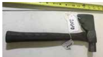
Lot#20698. Embossed American Rose Half Hatchet