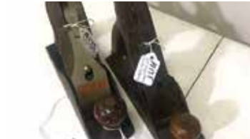
Lot#20375. 2- No 4 Size Planers, Ohio Tool Co. and Stanley N4