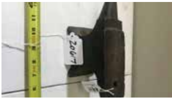
Lot#20617. 10 pound anvil, Nice