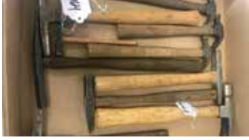
Lot#20764. Lot of 10 interesting small hammers, claw and more