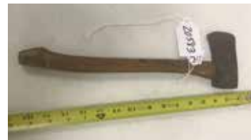
Lot#20583. Marbles No. 6 Camp Hatchet