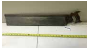
Lot#20355. Stanley 25 inch Steel back miter box saw