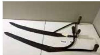
Lot#20279. 2 Hay Knives, one is patented July 20, 1875