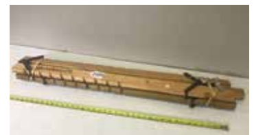
Lot#20220. Pair- 2 pieces Shopsmith panel clamps