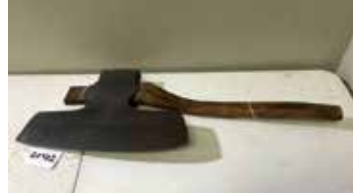
Lot#20402. Early JC Riutz 14 inch broad ax, early handle