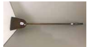
Lot#20452. Shandyman's Railroad Switch broom and ice chipper, rare