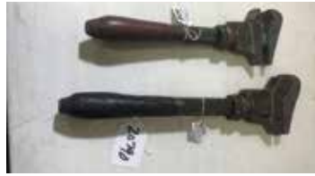
Lot#20790. Lot of 2 Bemis and Call Engineers Wrenches 15 and 12 inch