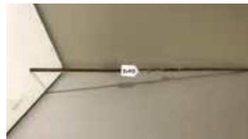
Lot#20443. 35 1/2 inch whittled pine cow poke