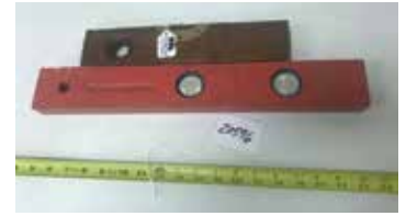
Lot#20596. 2 pieces, Early EM Chapin 12 inch level, and 18 inch Blue Grass Near Mint