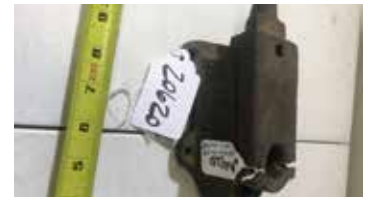
Lot#20620. Anvil 4 1/2 pound Marked Cheney Anvil and Vise Co. No. 10 Pat. Nov 18, 1878