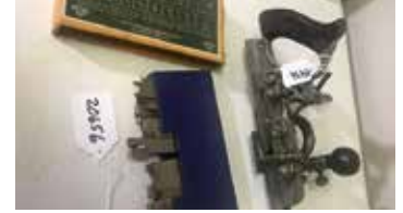
Lot#20656. Good Stanley No. 45 with full box cutters