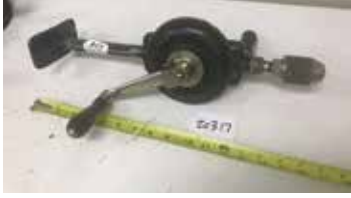
Lot#20317. No. 1555 North Bros. Yanker 3 jaw breast drill