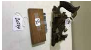
Lot#20554. Millers Patent No 143 Bull Nose Plow Plane with box cutters