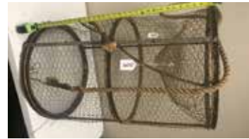
Lot#20299. Homemade fish trap