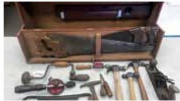
Lot#20802. Large wooden tool box with assorted tools, 32 x 16 x 7 inches