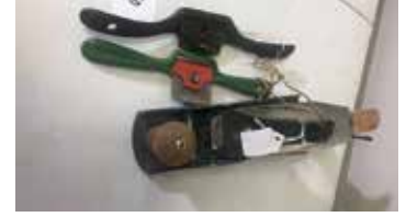
Lot#20740. Buck Bros. No 4 Size Hand Plane, and 2 spoke shaves