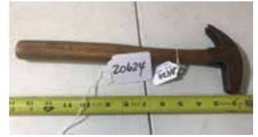
Lot#20624. Rare Stanley Farriers Hammer