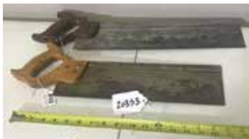
Lot#20353. 16 inch Steelback Saw, Cherry Handle, and 14 inch Steel Backsaw