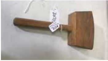
Lot#20713. Stanley No.9 Wooden Mallet, Marked