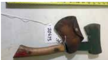
Lot#20673. Bridgeport Hardware Company Boy Scout Hatchet