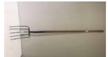
Lot#20248. Good 5 prong pitchfork