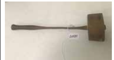
Lot#20584. Wooden Barrel Bung Hammer