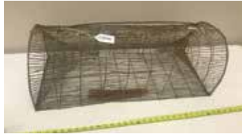
Lot#20266. Nice, Early, Live trap