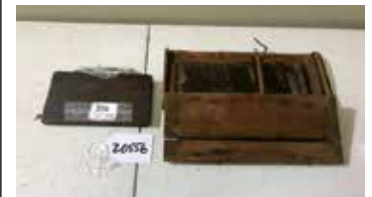
Lot#20556. 2 box cutters for Millers Pat. Planes