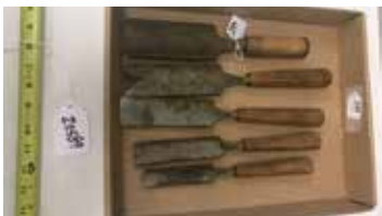
Lot#20589. 4 piece set of Hearshaw, Sheffield Gouges 1 1/4, 1 3/4, 2 and 2 1/8 inch