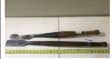
Lot#20488. 2 pieces, Bark Spud, and Long Handled 2 inch chisel