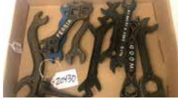
Lot#20430. Lot of 10 assorted Machinery Wrenches