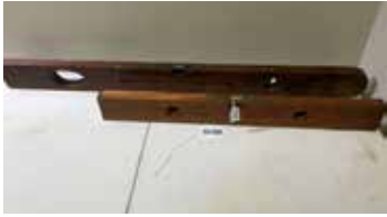
Lot#20768. Lot of 2 Stanley Plumb and Levels, no 35 masons and no 30 adjustable