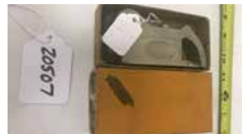
Lot#20507. Stanley No. 90 Bull Nose Rabbit Plane Original Box