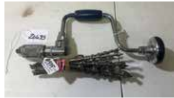
Lot#20635. Like New 923- 10 inch Hand Brace with set of 11 Stanley Bits