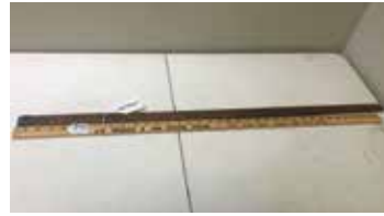
Lot#20427. Airworks and The Engine House Yard Stick w/old address