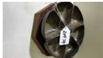
Lot#20479. Cobblers Cast Iron Nail Cup