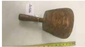
Lot#20326. Stone workers mallet