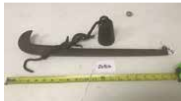
Lot#20306. Brass 20 inch Steelyard scale Marked J.S. Crow Bridge Co. Boston