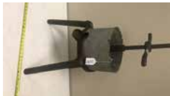
Lot#20250. P Smith and Sons Sidney Ohio Lard press