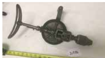
Lot#20386. AJW & Co. Boston Mass. Heavy Breast Drill