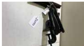
Lot#20390. Unmarked Saw Sharpening Vise