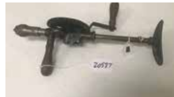
Lot#20587. Early Victor Stanley Rule and Level 2 Jaw Breast Drill