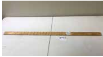
Lot#20426. Lot of 2 Early timbermens ruler log rule and tree estimator rule