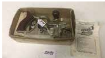
Lot#20498. Craftsman Combination Plane complete, No 45 in original box