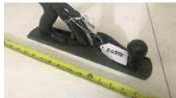
Lot#20358. Winchester no. 3010 No 5 size Bench Plane