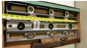
Lot#20406. Tray lot, 7 wood and iron levels