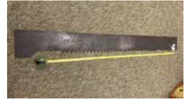
Lot#20240. Early Up and Down Saw Blade 6 foot heavy