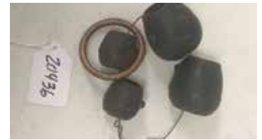
Lot#20436. 2 pair bovine horn weights and brass bull ring