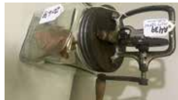
Lot#20639. Dazey 3 Quart Bullseye Butter Churn