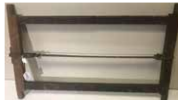
Lot#20475. 44 inch tall framed type splitting saw