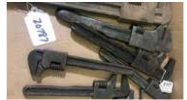
Lot#20787. Lot of 7 Automotive Type Wrenches