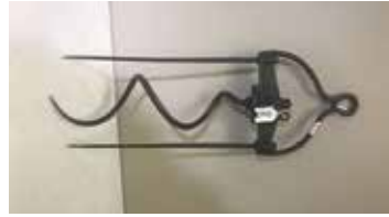
Lot#20602. Patented March 6 1866 Screw Type Hay Harpoon, scarce