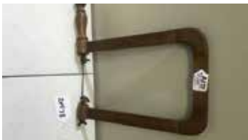
Lot#20473. Handsome wooden coping saw