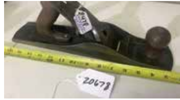
Lot#20678. Stanley No. 5 1/2C Heavy Jack Plane