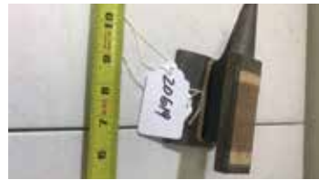
Lot#20619. Carroll Co. Oh Coal Mine Rail Anvil (repurposed)