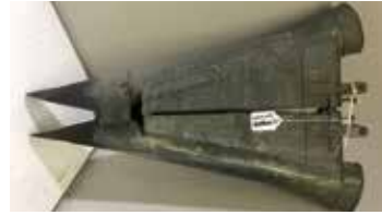
Lot#20239. Scarce Double Tube Tobacco Setter