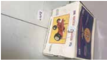
Lot#20717. 2008 Kentucky Association FFA 1/16 scale D21 Allis Chalmers Tractor