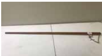
Lot#20421. Early Walking stick rule, HC Hanson foundry, 1872-1922