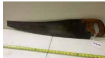
Lot#20359. Early Disston Dock Saw, rip