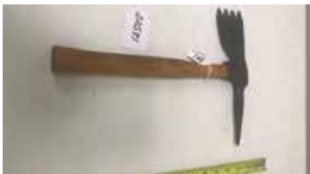
Lot#20581. Early Ice Hatchet with replaced handle