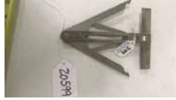
Lot#20599. Stanley no. 30 Angle Divider complete and nice