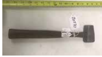
Lot#20570. Scarce Prospectors Rock Hammer