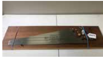
Lot#20614. Disston D76 Commemorative Handsaw 1776-1976 No. 0893/1000 on display bd.