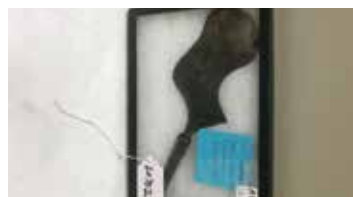
Lot#20702. Primitive Ceremonial West India Voodoo Knife, we believe