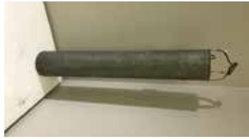
Lot#20202. Nice 30 inch tube type well bucket