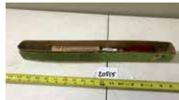
Lot#20555. Yankee No 130A Spiral Ratchet Screwdriver in original box