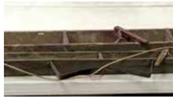
Lot#20298. Lot of 2 wooden grass seeders