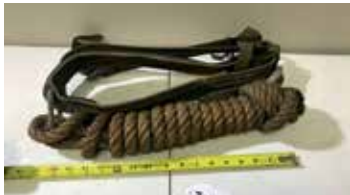
Lot#20409. Tree Climber Safety Belt rope and climbing spikes