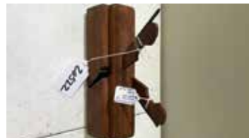
Lot#20522. McKinnell & Co. 2 way Match Plane Tongue & Groove, Marked Cin. 0