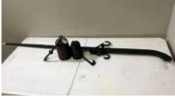
Lot#20233. 55 inch long Steelyard scales with 2 weights