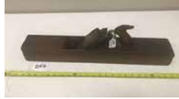
Lot#20514. Holiday & Smith 24 inch Jointer Plane