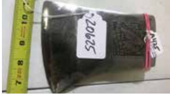
Lot#20625. Nice Black Raven Axe Head, Marked Kelly Axe, Charleston W Va