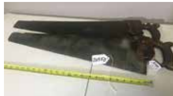
Lot#20350. 2 early saws for restoration Spear and Jackson, and Finness and Bro.