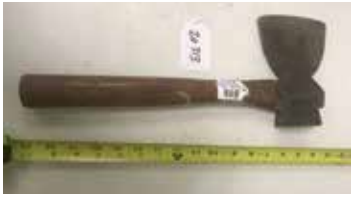
Lot#20313. Early 4 1/2 inch C Hammond Broad Hatchet