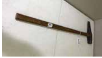
Lot#20234. Hubbard No.8 Special Alloy Chisel Hammer used to cut Railroad Track