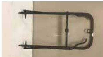
Lot#20278. Early hay harpoon