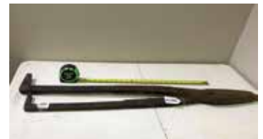
Lot#20280. All iron 43 inch long metal shears