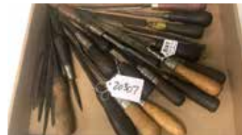
Lot#20307. Lot of 20 Handled Bearing Scrapers