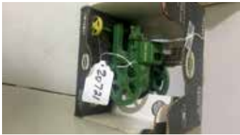
Lot#20721. John Deere Model E 1/6 Scale Hit Miss Engine on cart Original box