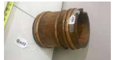
Lot#20640. Wooden Storage Vessel, about 2 gallon