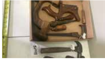
Lot#20798. Lot of 8 Early Carpenters Tools, good stuff here