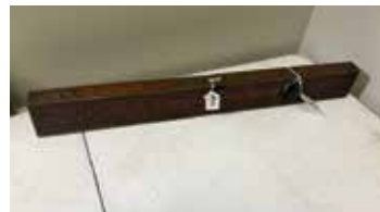
Lot#20415. Stanley Sweetheart No 93 Brass Bound plumb and level