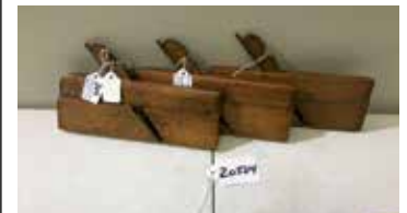
Lot#20504. 3 Molders, Marked Buckeye Plane Co. Ohio Tool CO. Brand