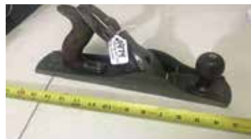
Lot#20674. Stanley No.5 Jack Plane Sweetheart Blade