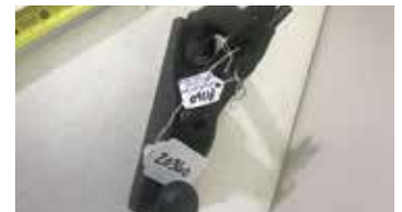
Lot#20360. Winchester No. 3006 no 3 size Bench Plane (damaged tote)