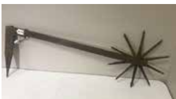
Lot#20701. Classic Wm. Greenlief Log Calipers with walking wheel measurer