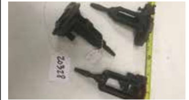
Lot#20328. Lot of 3 Spoke Cutters, Pheonix, Wood MFG and unmarked