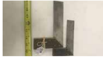
Lot#20538. 2 pieces Sodderington Hardware Co. Winter Bottom Tri and Miter Square