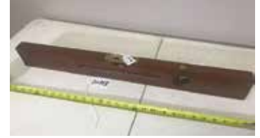
Lot#20348. Winchester 28 inch cherry plumb and level