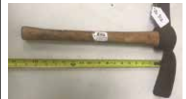
Lot#20312. Small Grubbing Matix, for Ginseng