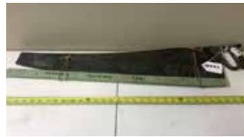
Lot#20343. Clean Simonds 30 inch blade docking saw