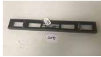
Lot#20595. Stanley no 36- 18 inch plumb and Level all iron