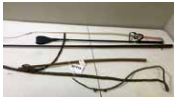
Lot#20446. Lot of 4 whips, 2 early, 2 later