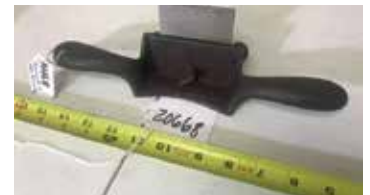
Lot#20668. Stanley No. 8 Scraper, RARE not in catalog