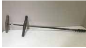
Lot#20231. 2 Dynamite Blaster Augers, 49 and 64 inches long