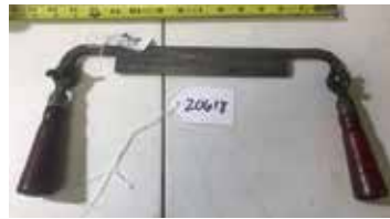
Lot#20618. No 8 Pexto Folding Handle Drawknife