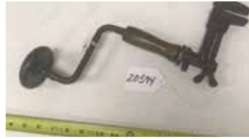
Lot#20594. Lowenstraub Brace Wrench for Buggy Wheels