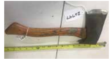
Lot#20747. True Temper Tommy Axe with replacement Boy Scout Handle