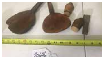
Lot#20646. Lot of 5 Butter Tools, 2 paddles etc.