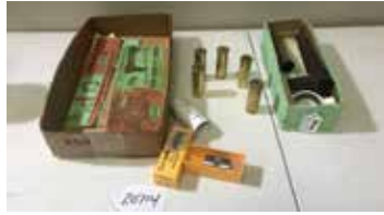
Lot#20714. Gun Related Items, 5 Brass 12 Gauge Shell Casings, Powder and Bullets Scale