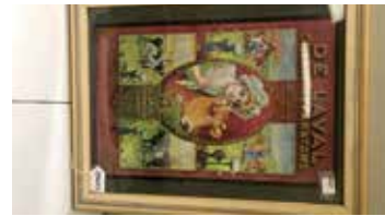
Lot#20687. Framed DeLaval Cream Separator Print, Nice graphics