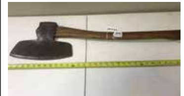
Lot#20492. Nice GW Bradley 11 3/4 inch Broad Axe, nice, replacement handle