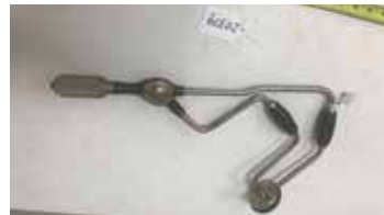
Lot#20379. Stanley No 993 Corner Brace, excellent condition