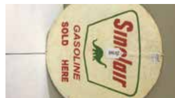
Lot#20703. 20 inch round metal Sinclair Gasoline Sign