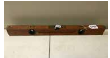
Lot#20412. Stanley Sweetheart No. 13 plumb and level