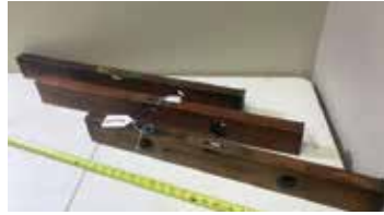
Lot#20770. 3 Good Stanley levels, 2- 30 inch cherry, and No 30 26 inch