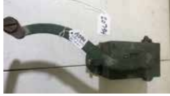
Lot#20794. Crank Type Lifting Device, many possibilities