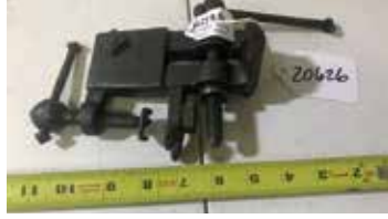
Lot#20626. Neat Small Bench Vise, 2 inch jaws