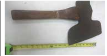
Lot#20316. Broad Axe, Beatty Chester PA 11 inches