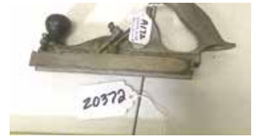
Lot#20372. Stanley No 49 Tongue and Groove Plane