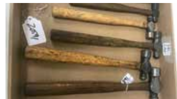
Lot#20591. 5 different size Stanley Ball Peen Hammers, 4 oz to 20 oz