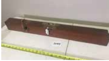
Lot#20345. 2 nice Belnap Hardware Co. BlueGrass 30 inch cherry wood levels