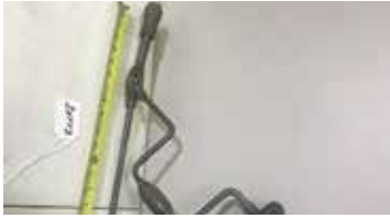
Lot#20772. Early Corner Brace