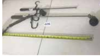
Lot#20346. 2 Bimis and call Steelyard scales