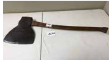
Lot#20203. 1 Willey 8 1/2 inch shipwright's axe