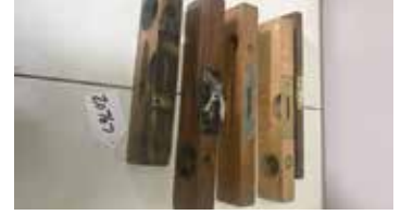
Lot#20767. Lot of 4 good 12 inch levels and 1 19 inch level