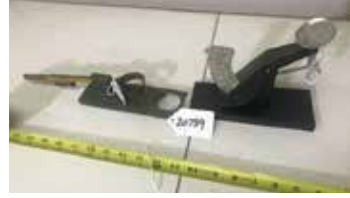
Lot#20739. Lot of 2 egg scale, one unique and one unusual