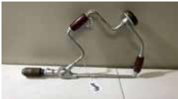
Lot#20493. Millers Falls No. 502 Corner Brace