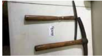
Lot#20398. Lot of 2 small miners picks