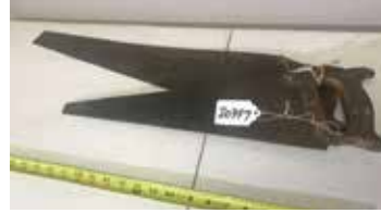
Lot#20347. 2 early Hand Saws, 18 and 24 inch, handles different