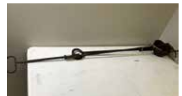
Lot#20224. 2 pieces, smelter ladle, and clinker grabber