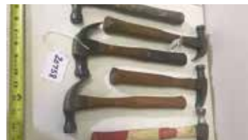
Lot#20758. Lot of 6 good Stanley Claw Hammers, incl no 100 Plus