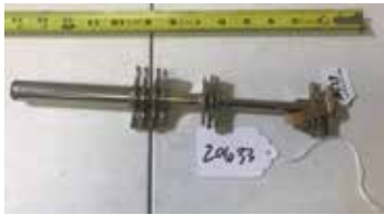
Lot#20633. Nice Set of Cork Cutter 11 piece St. Gaskets