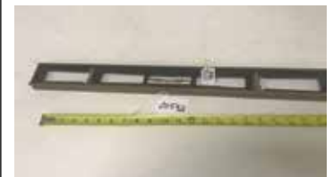
Lot#20592. Stanley No. 366- 24 inch iron plumb and level