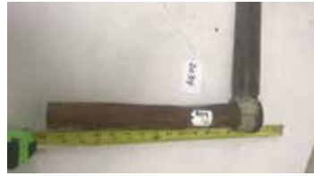
Lot#20314. Older 8 inch broad froe