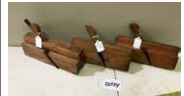
Lot#20524. 3 Cincinnati Moulders, all Mid 1800's