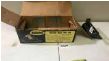
Lot#20629. Stanley No. 116 Miter Box in original box