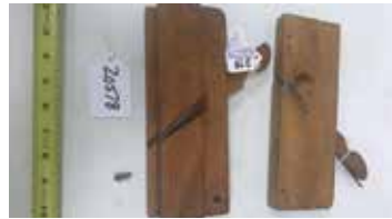
Lot#20578. 2 Moulding Planes Higley Ohio City and Philmore Zanesville Oh