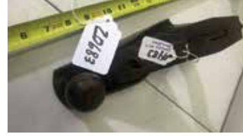
Lot#20683. Stanley No. 3 Bench Plane Keyhole Slot Cap