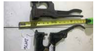
Lot#20476. 2 pieces, leather riveters (Best Yet) and Sheeham MFG Co. Salem Oh