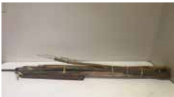
Lot#20213. Lot of Brush Hook, frail parts, Village Blacksmith handle