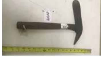
Lot#20318. Early Ice Hatchet