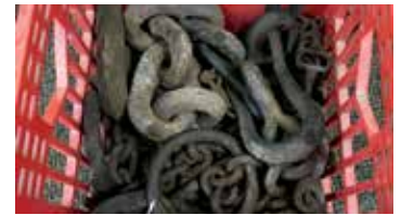
Lot#20212. Lot of various chain, Heavy drill