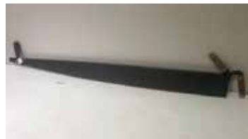
Lot#20470. 2 man saw, a bit different, 60 inches long