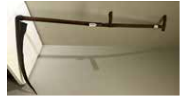
Lot#20456. Early Type Mowing Scythe