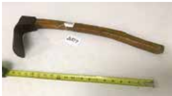
Lot#20377. Early Gutter Adze