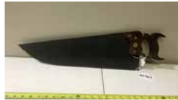
Lot#20467. Early Split Nut Flooring saw