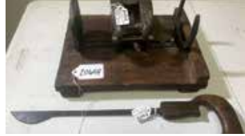
Lot#20654. Keiver Stone Asparagus Buncher with asparagus knife