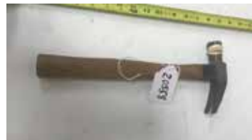
Lot#20558. Nail Starting Hammer Claw marked Magna Head