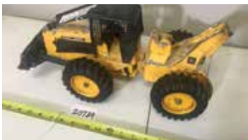
Lot#20729. Ertl Scale Model John Deere Log Skidder