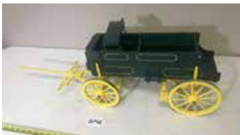
Lot#20725. Wooden Model Boxbed Wagon, yellow undercarriage, green box bed