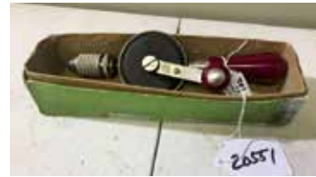
Lot#20551. Yankee No 1431A Hand Drill in Original box