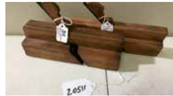
Lot#20511. 2 Pieces, G. Roseboom Profile Planer, 1 marked Kruse Co. mid 1800's