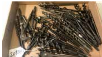
Lot#20334. Tray Lot, dozens of various auger bits