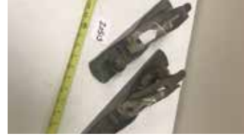
Lot#20515. 2 pieces, 2 Stanley Bailey No 5 Jack Planes, both good