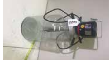
Lot#20655. Glass Sears and Roebuck Co. Electric Butter Churn like new