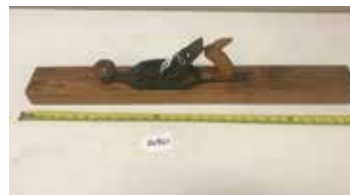
Lot#20367. Stanley Rule And Level No 34 Transitional Plane, scarce