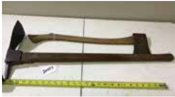
Lot#20257. 4 x 19 inch Solid Steel Saw Doctor Anvil, Round