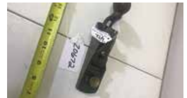
Lot#20672. L Bailey No 15 1/2 Low Angel Tailed plane, Pat. Aug 30 1858, cracked cheek