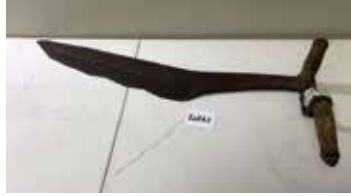
Lot#20262. HBS and Co. OVB Hay Knife Pat. Sept 5, 1899