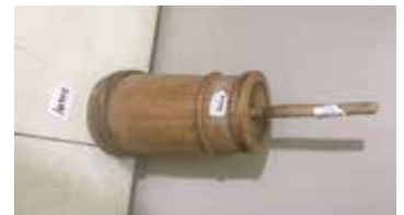
Lot#20644. 13 inch tall 3 piece wooden stomper butter churn