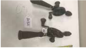
Lot#20321. 2- 3 jaw Hand Drills, with Bits in handle, 1 is Craftsman