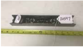
Lot#20537. 12 inch iron Plumb and Level Springfield Tool CO