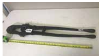
Lot#20223. 36 inch porter BULLDOG Bolt Cutter