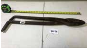
Lot#20289. 26 inch iron metal shears