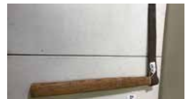
Lot#20388. 12 inch bladed froe