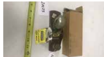
Lot#20523. Later Model Stanley No. 110 Block Plane in original box