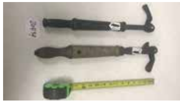
Lot#20434. Lot of 2 nail pullers, Rex and Red Devil