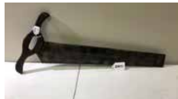
Lot#20671. Uncommon Roughing Saw Handsaw, 2 handed