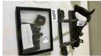
Lot#20550. Millers Pat No 41 Plow Plane w/ philister bed and cutters