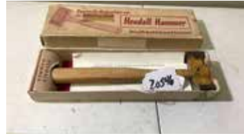
Lot#20546. Rare Kinners Hexdall Hammer, Morris ILL with history enclosed in original box