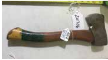
Lot#20706. Plumb Boy Scout Hatchet, handle marked Official Boy Scout