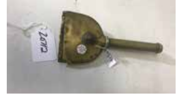
Lot#20712. Brass 19th Century Horse Groomers Torch, Parker's Patent