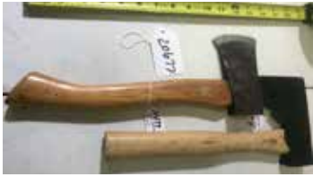
Lot#20677. 2 Stanley Hand Axes 2 pieces, 1 like new