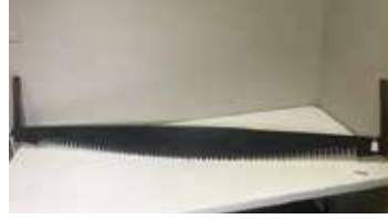
Lot#20458. 6 foot 2 man saw, different tooth