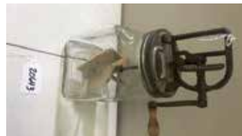
Lot#20643. Dazey 4 quart Flowered Bottom Butter Churn