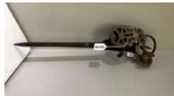
Lot#20275. Hay Spear Type Harpoon and pulley