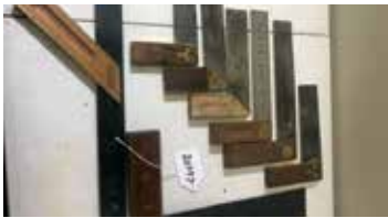
Lot#20337. Lot of 8 various try squares